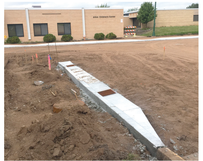
One layer of bituminous and new sidewalks are laid in the area of Rippleside Elementary in Aitkin as a large sewer project nears completion.