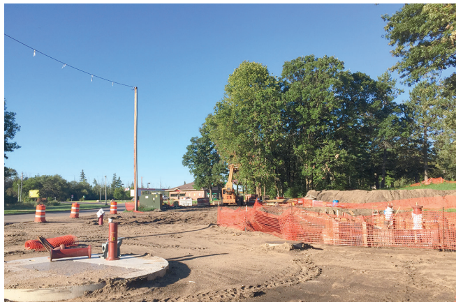
A large new area houses a sewer lift station and fresh water boosting station near Lum Park and the Sinclair Station in northeast Brainerd.

By ANN SCHWARTZ Those driving to Brainerd from the east or hanging around northeast Brainerd have seen the huge, $11 million Brainerd Airport Utility Extension project that's been underway this whole construction season.