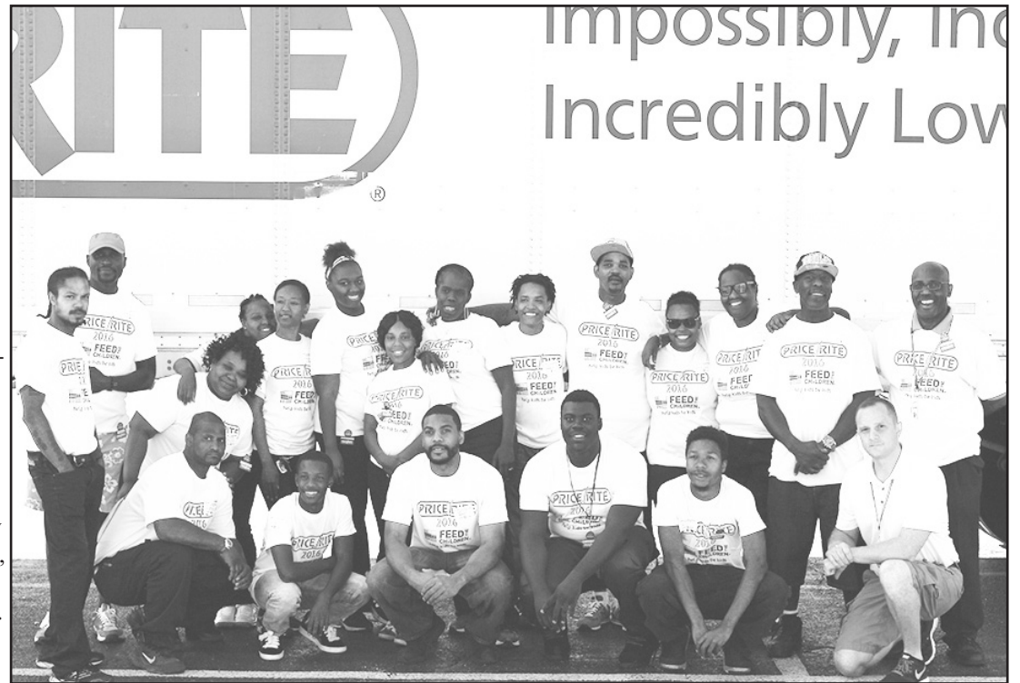
These Price Rite employees were among the 40 volunteers who helped to distribute items during the Food Drive on Tuesday, August 23, 2016 at Price Rite located at 6606 Woodlawn Drive in Woodlawn, Maryland.

Feed the Children was established in 1979, and seeks to end child hunger. It is one of the largest U.S.-based charities and serves those in need in the U.S. and in 10 countries around the world. It provides food, education, essentials and disaster relief. The Salvation Army is an evangelical part of the universal Christian Church, whose mission is to preach the gospel of Jesus Christ and to meet human needs in His name without discrimination.