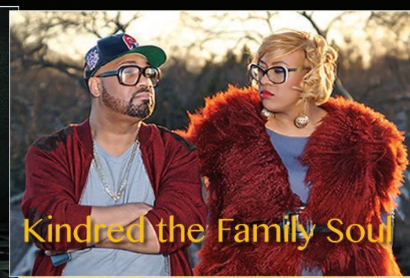
Kindred the Family Soul