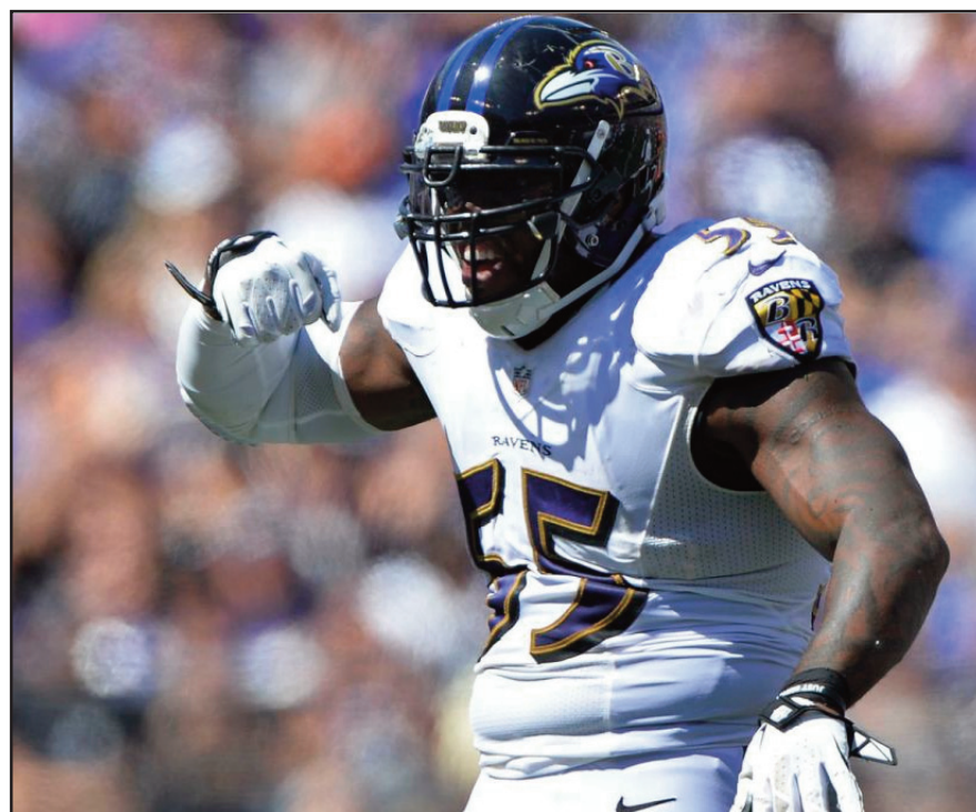
Ravens outside linebacker Terrell Suggs celebrates after making a play during the 2015 NFL season.