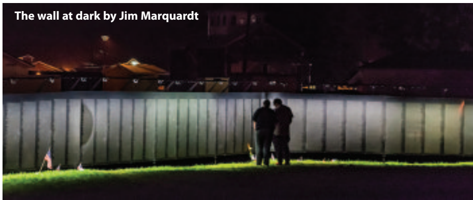
The wall at dark

To find out more about CCAT very important mission to reduce the use of alcohol, tobacco, and drugs among our youth through education and activities, please visit our website at www.ChardonCommunityActionTeam.org . We encourage anyone with an interest in our mission to attend one of our monthly meetings held on the third Tuesday at 7 PM at the Chardon Municipal Center, which is located at 111 Water Street, Chardon, Ohio 44024.