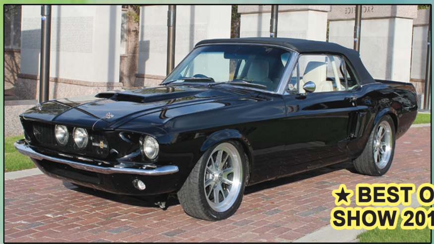
★ BEST OF SHOW 2015