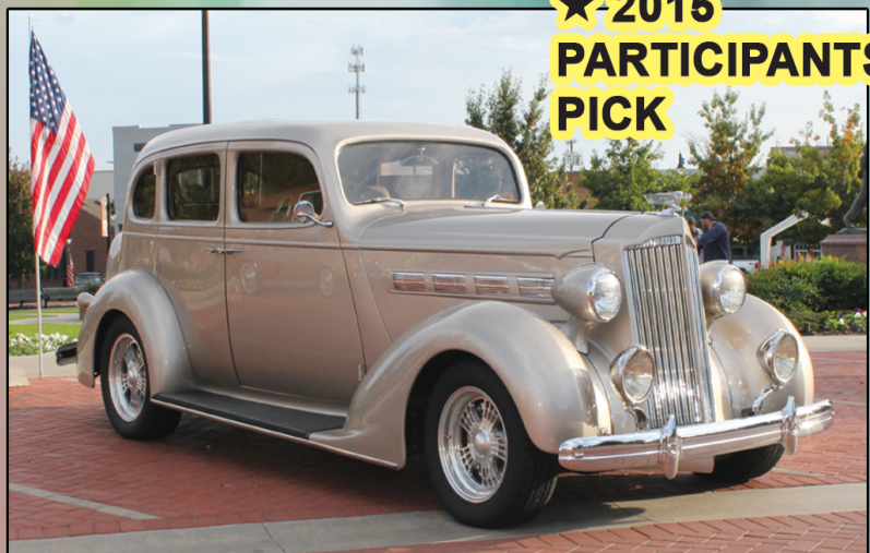
★-2015 PARTICIPANTS PICK