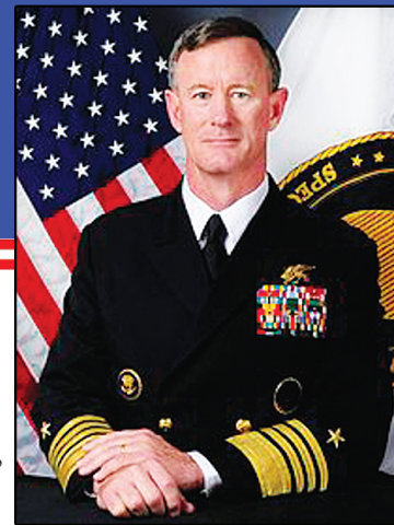
William H. McRaven

United States Navy Admiral - Served in Afghanistan