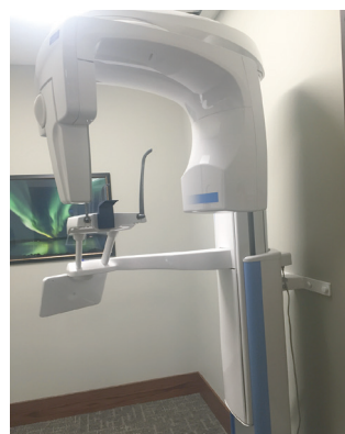
The new panoramic x-ray machine will offer more comfort for patients.