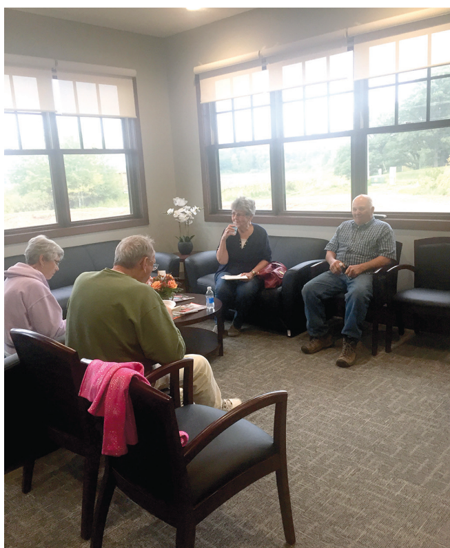
The spacious waiting room has large windows and a children's corner. Many attended a Sept. 24 open house where lunch was served.