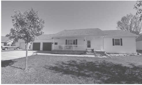
HOFMEYER 301 Kentucky Ave. NW