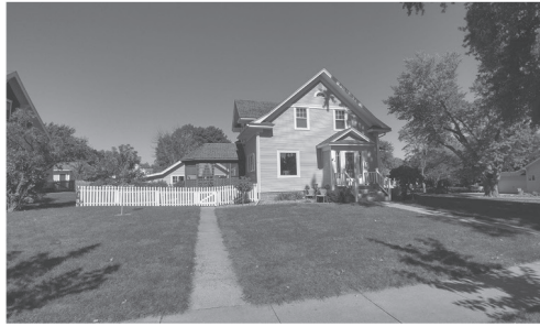
WEBER 323 2nd St. NE