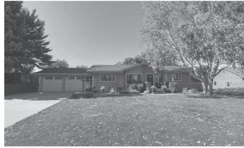
PLENDER 604 Juneau Ave. SE