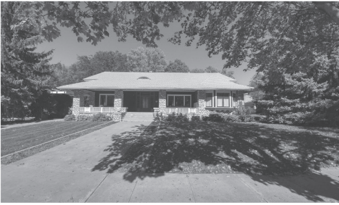
GAMBLE 119 2nd St. SW