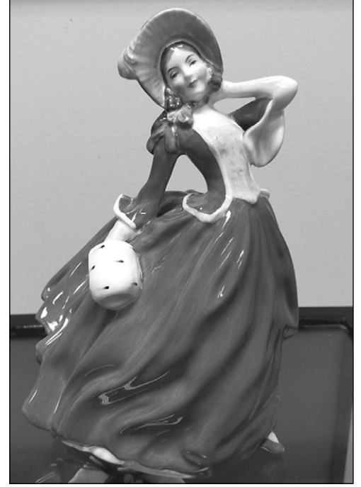
Produced between 1940 and 1997, this 8" Royal Doulton "Autumn Breezes" figurine depicts a young woman caught in a gust of wind with her red dress rippling in the breeze.

Located in the Michael Klahr Center on the campus of the University of Maine at Augusta, the HHRC is open Monday through Friday from 10 a.m. to 4 p.m. or by appointment. There is no fee to visit the center, which features permanent and rotating exhibitions. For more information, call 621-3530 or see hhrc-maine.org .