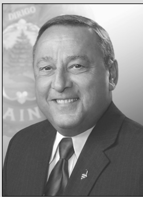
Governor Paul R. LePage

Our administration has created a tuition waiver program for all Maine National Guard members to attend the University of Maine System, the Maine Community College System and Maine Maritime