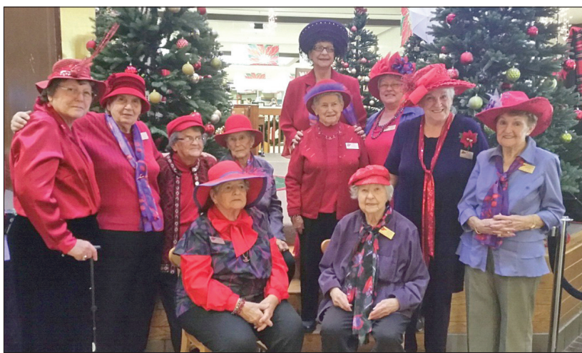
Bring your unwrapped toys for children of all ages to the Auburn Mall on Friday, November 18, from 11 a.m. to 1 p.m.

The rambunctious Red Hatters will host their 11th annual Christmas Toy Drive on Friday, November 18, from 11 a.m. to 1 p.m. at Center Court in the Auburn Mall.