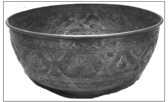
Made in Israel, this antique hammered copper bowl with highly detailed floral pattern is 5.5 inches tall and 11.5 inches across.