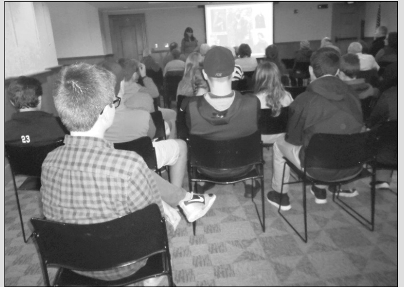
Hebron Academy students who have been engrossed in Shakespeare since the beginning of the school year in September.

He served 14 years as the Producing Artistic Director of The Theater at Monmouth, The Shakespeare Theater of Maine. He has been a theater artist and arts administrator for more than 25 years. He continues to participate in interesting and creative projects of all kinds around the state as a theater artist, consultant and grant writer.