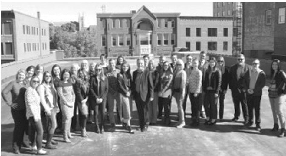
The Rinck team on the roof of the W.T. Grant Co. building in Lewiston, where the agency plans to move by January 2017

Is there anything cooler than a full-service advertising, marketing and public relations agency working out of an early 1900s downtown department store?