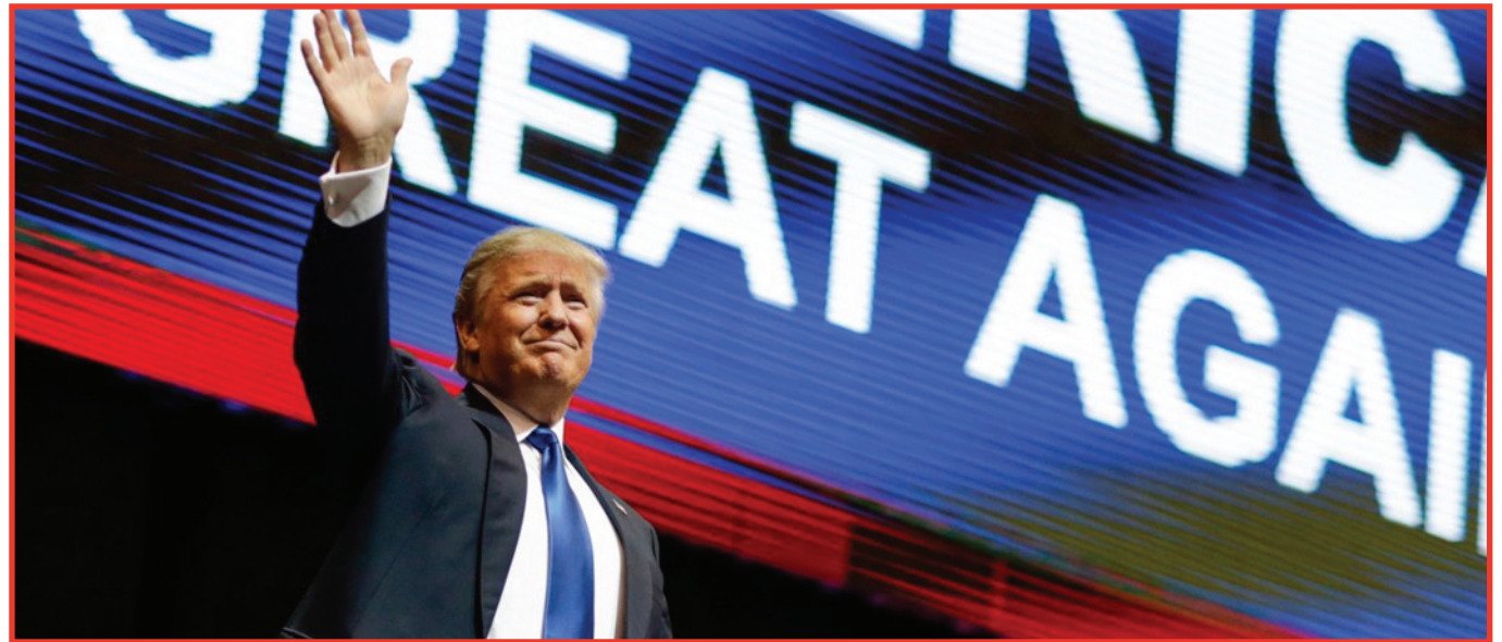
Donald Trump was elected the 45th president of the United States on Tuesday, November 8, 2016

Last year, Rawlings-Blake announced that she would not seek re-election,