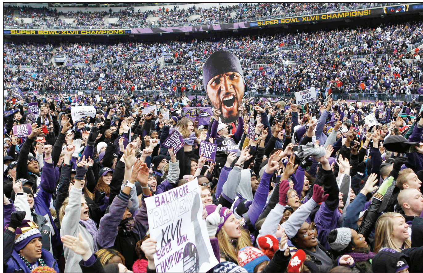
Baltimore Ravens fans fill M&T Bank Stadium in Baltimore after the team won Superbowl XLVII in February 2013.

For concession prices, the study considered the total price of the cheapest beer