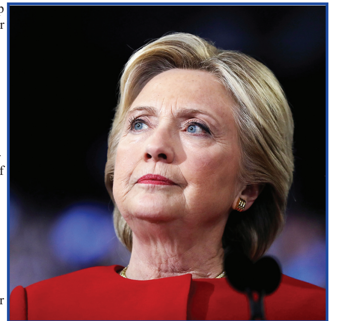
Hillary Clinton: “Donald Trump is going to be our president. We owe him an open mind and a chance to lead”

“To all the women and especially the young women who put their faith in this