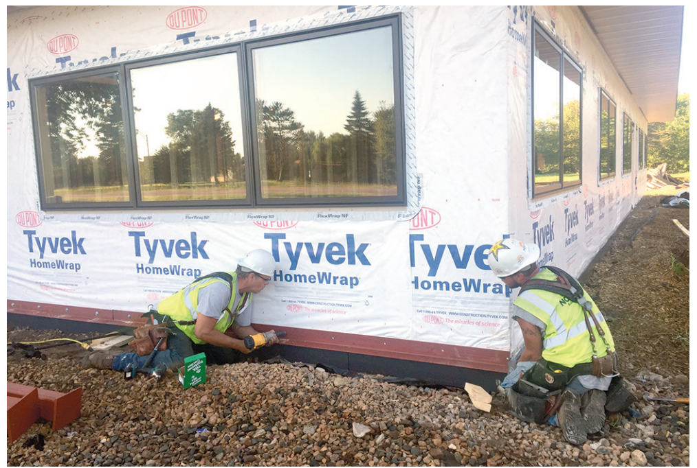
Norson workers working on the exterior of the bank. It is on Hwy. 210 west in Aitkin. The building started as a funeral home and was later a daycare center.