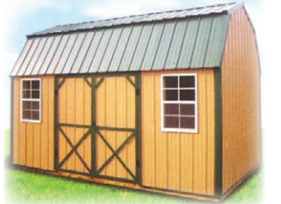
AS SHOWN 10X12 $123.84 MONTH Rent to Own

WWW.ELLISVILLEMOTORS.COM 601-323-0464 12 Months SAC *wac 303 HWY. 11 S. ELLISVILLE, MS • LOCATED BETWEEN PIZZA HUT & J.C.J.C