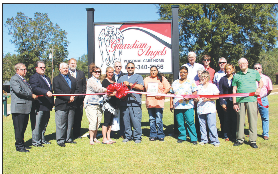
Guardian Angels Personal Home Care recently held their ribbon-cutting, which was facilitated by the Jones County EDA. Guardian Angels is located at 12 Victory Road in Laurel. The facility opened in April. For more information about Guardian Angels and the personal home care services they offer, call 601.340.5156 or 601.498.1740.