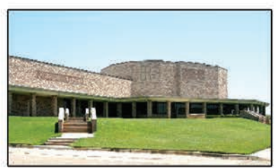
Fine Arts Building