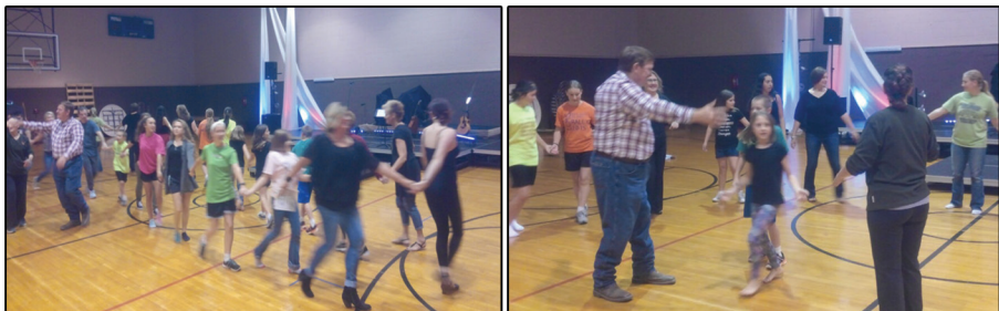
Community Players and volunteers practice for Fezziwig's Ball.

I peeked in to a rehearsal last night where a crowd of dancers of all ages were working on the steps for a scene from "Fezziwig's Ball". Merriment was high. I think they've got the Christmas Spirit already! You may recognize some of the dancers. Next week, the Sulphur Springs Symphony League will start adding musical accompaniment to rehearsals.