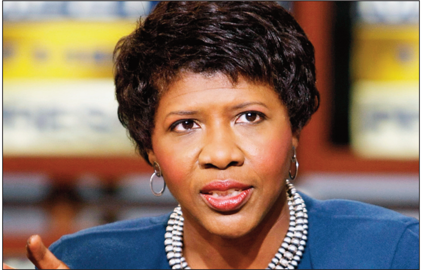
American Peabody award-winning journalist, television news broadcaster and author, Gwen Ifill died on Monday, November 14, 2016, at the age of 61. A long-time and dedicated member of National Association of Black Journalists, Ifill was inducted into the organization's Hall of Fame in 2012.