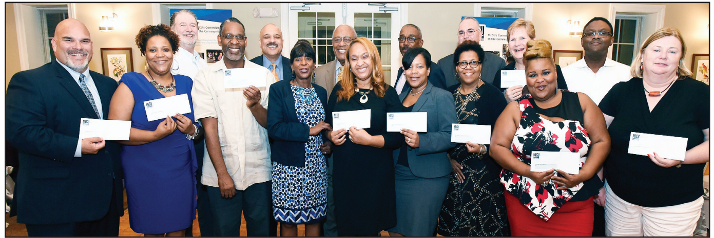
Officials from MECU and the MECU Foundation presented representatives from CollegeBound and MECU’s nine Baltimore City partner schools with $35,000 on October 19, 2016. Raised at the 12th Annual MECU Charity Cup Golf Tournament in September, the funds will be used to purchase school supplies and meet other needs for the young students and to help older students realize their dream of a college education.

MECU’s nine partner schools include Arlington Elementary, Cross Country Elementary /Middle School, Ft. Worthington Elementary/Middle School, Graceland