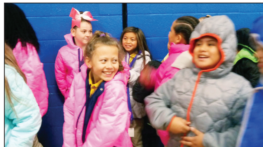
Morrell Park students enjoy trying on coats during give-away B.