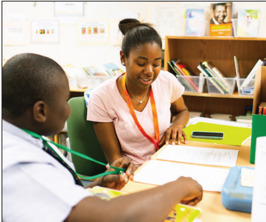
Reading Partners' volunteers help thousands of students make the all-important shift from learning to read, to reading to learn. (Above) A Reading Partners tutor working with a student.

The proven early literacy organization has been providing volunteer-led, individualized reading support to students in under-resourced public elementary schools in Baltimore since 2012. It is critical that Reading Partners students