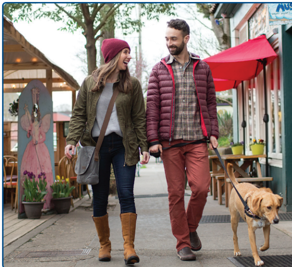
Featuring Saratoga Springs' Best Selection of Winter Clothing and Outerwear for Active Lifestyles!