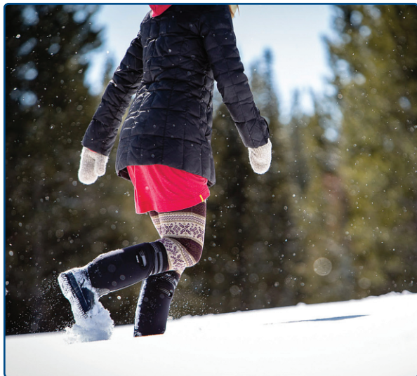
Gear & Footwear for in Town and Off the Road!

Friday: 6am to 9pm • Saturday: 9am - 9pm • Sunday: 9am - 7pm