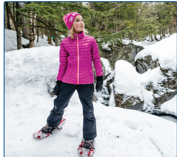
Gifts and Outdoor Gear for Kids of All Ages