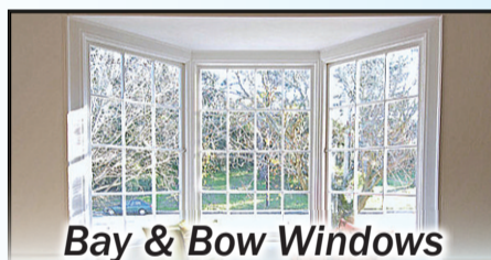
Bay & Bow Windows

That's Why Over 39,000 Homeowners Have Chosen Paramount