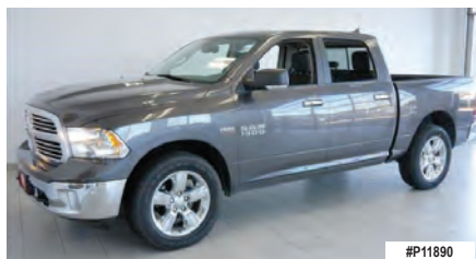
2014 RAM 1500 BIG HORN CREW CAB

HEMI PROTECTION PACKAGE, CHROME 20" WHEELS, TOW PACKAGE LAKE COUNTRY'S LOW PRICE $29,987