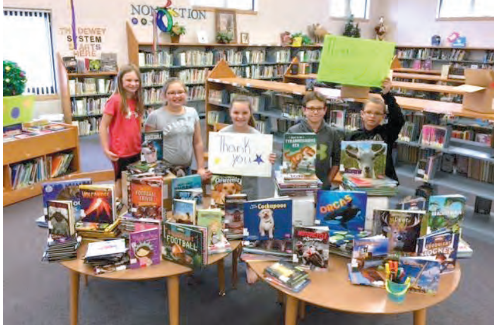
Students from Ripplside Elementary School say thank you for the Ruttger's Enhanced Reading Fund donation. The students are surrounded by some of books purchased with the money donated.

Ruttger's Bay Lake Lodge donated $7,400 to Ripplside Elementary school in Aitkin and Cuyuna Range Elementary School in Crosby-Ironton to assist with their reading programs.