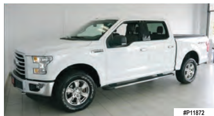
2015 FORD F-150 XLT SUPERCREW

5.0V8, CHROME PACKAGE, TOW PACKAGE, POWER SEAT LAKE COUNTRY'S LOW PRICE $29,599