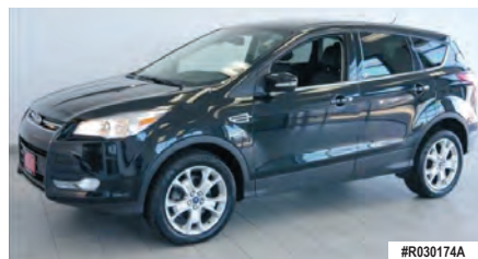
2013 FORD ESCAPE SEL AWD

LEATHER HEATED SEATS, BACKUP CAMERA, POWER SEAT LAKE COUNTRY'S LOW PRICE $17,998