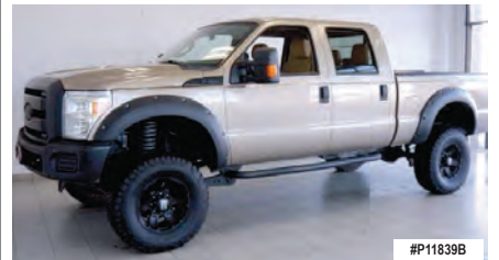
2011 FORD F-250 XLT SUPERCREW

POWERSTROKE DIESEL, RUGGED COUNTRY LIFT 33" TIRES, TOW PACKAGE LAKE COUNTRY'S LOW PRICE $29,987