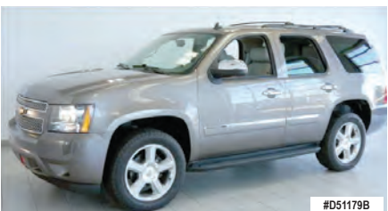
2013 CHEVROLET TAHOE LTZ

NAVIGATION, MOONROOF, DVD, 20" WHEELS, TOW, QUADS LAKE COUNTRY'S LOW PRICE $32,998