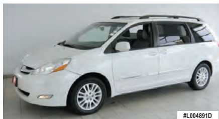
2009 TOYOTA SIENNA LIMITED

NAVIGATION, MOONROOF, LEATHER HEATED SEATS LAKE COUNTRY'S LOW PRICE $7,987