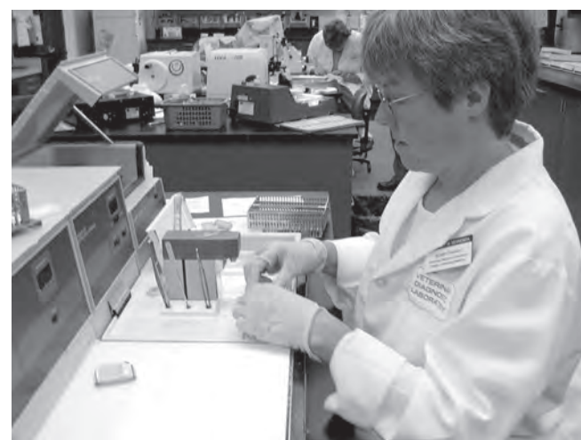
A lymph node from a white-tailed deer is prepared for analysis under a microscope at the University of Minnesota's Veterinary Diagnostic Laboratory.