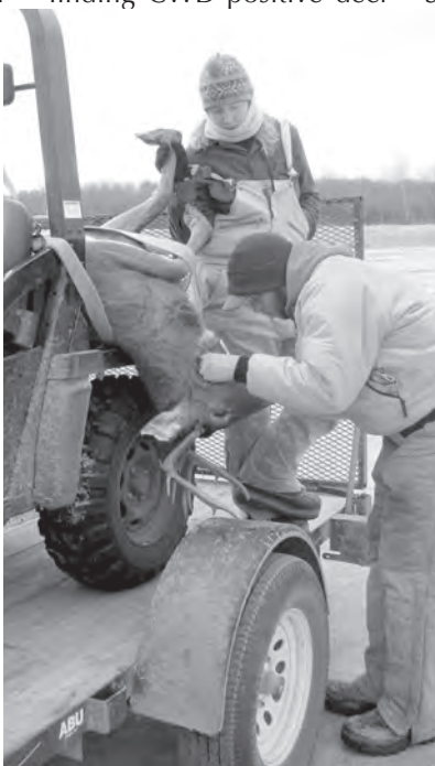
A DNR employee removes lymph nodes from a white-tailed deer at a registration station to test for chronic wasting disease.

"We want to thank hunters who have brought their deer to our check stations for sampling," he said. "While finding CWD-positive deer