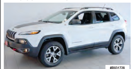
2015 JEEP CHEROKEE TRAILHAWK

LEATHER, BACKUP CAMERA, 4X4, REMOTE START LAKE COUNTRY'S LOW PRICE $24,998