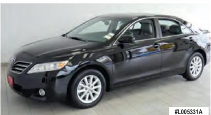
2011 TOYOTA CAMRY XLE

LEATHER, MOONROOF, HEATED SEATS, POWER SEATS, ONLY 52K MILES LAKE COUNTRY'S LOW PRICE $12,987