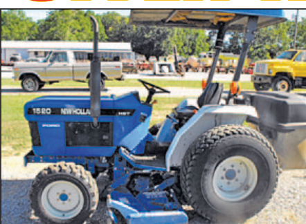
1520 New Holland, 4x4, 60" mower deck, w/bagger, power steering, Nice! New Price! $8,850