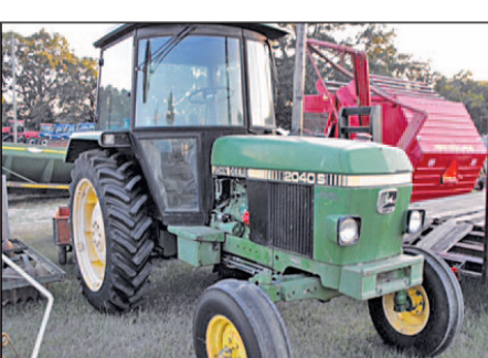
2040S John Deere C/A, single remote, cold air! 4,500 hrs. Price Reduced $9,350