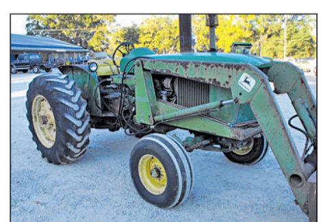
3020 John Deere w/48 ldr. RARE! low profile utility model, runs and works great! $10,800