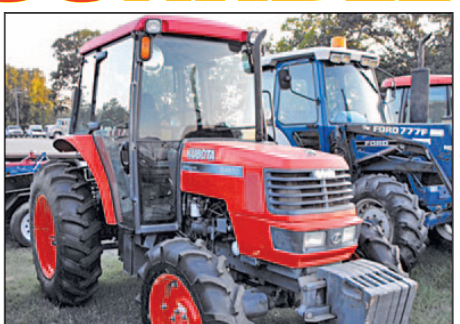
M4900 Kubota, 4x4, C/A, all new tires, shuttle trans. New Price! $15,900