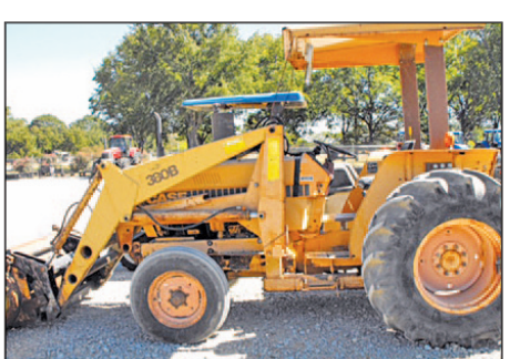
380B Case w/case loader, QA bucket and forks, Diesel, 3pt, live pto, shuttle trans. $7,500