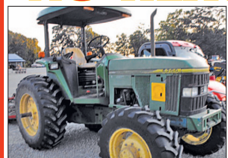
6200 John Deere, 4x4, canopy, good tires, single remote, high hrs. but very sound. New Price! $11,500