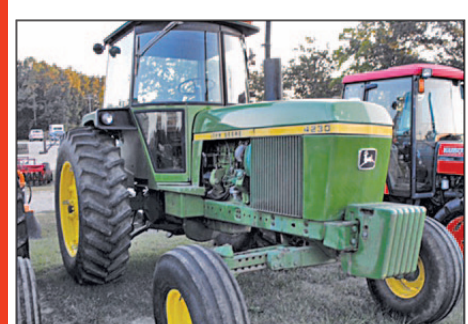
4230 John Deere, C/A, NEW 134A system, Quad-range, 6,480 hrs. One of a Kind! $21,500