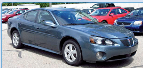
2007 PONTIAC GRAND PRIX $6,495