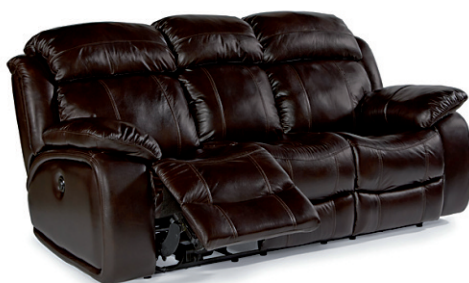
Como Leather Power Reclining Sofa