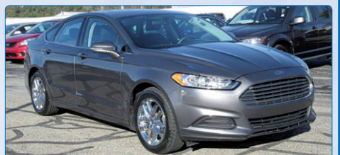
2013 FORD FUSION $8,995

BLACK 4WD, Virginia car, trade-in, third row EDDIE BAUER