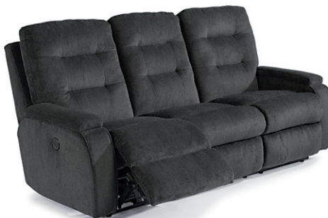
Kerrie Power Sofa