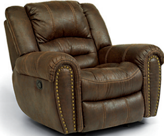
Downtown Power Recliner