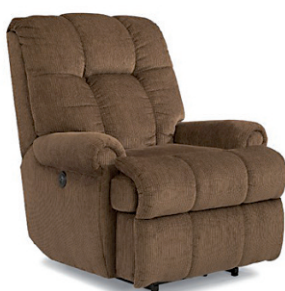
Hercules Power Recliner