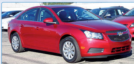
2011 CHEVROLET CRUZE $7,995

RED 108k miles, eco, great gas mileage, awesome car