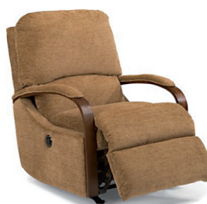
Woodlawn Power Recliner