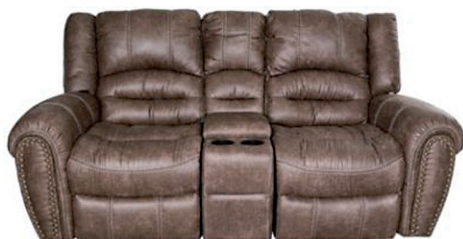
Downtown Power Loveseat with Console

Every Flexsteel Sofa, Loveseat, Chair or Recliner is on Sale for this Event! Even Special Orders!