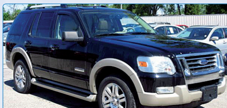
2006 FORD EXPLORER $7,995

RED 108k miles, eco, great gas mileage, awesome car