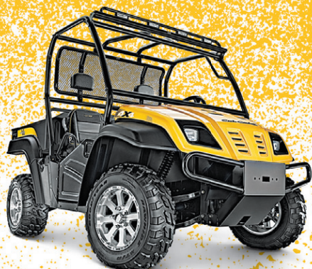
VOLUNTEER™ 4x4 EFI SERIES UTILITY VEHICLES