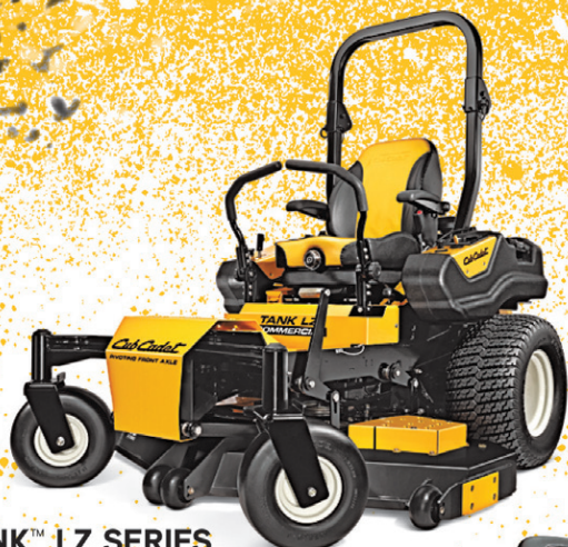
TANK™ LZ SERIES COMMERCIAL ZERO-TURN RIDERS