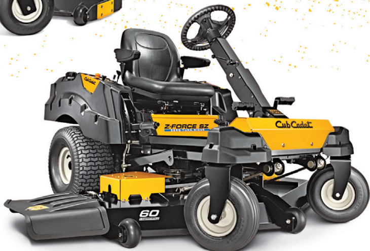
Z-FORCE® SZ SERIES FOUR-WHEEL STEER ZERO-TURN RIDERS