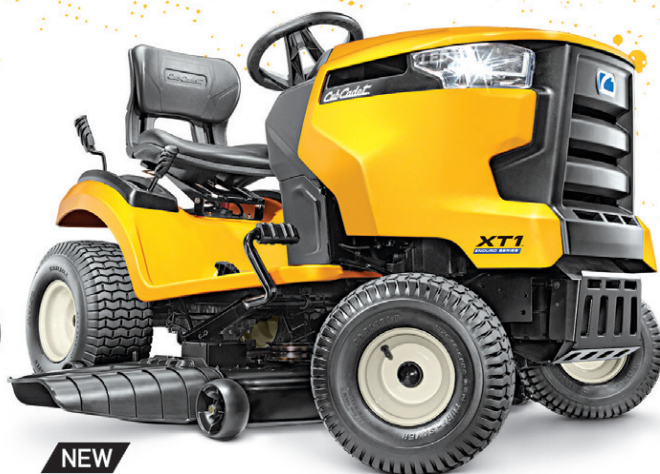
NEW XT ENDURO SERIES™ LAWN AND GARDEN TRACTORS

EXCEPTIONAL FACTORY AVAILABLE ON SELECT MODELS