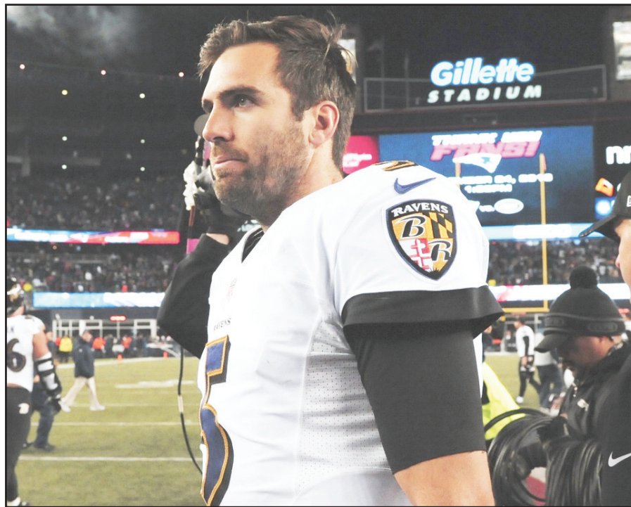
Ravens quarterback Joe Flacco walks off the field after the week 13 loss to the New England Patriots.

Harbaugh has a simple plan for the remaining games this season— win them all. It starts on Sunday, December 18, 2016 with the final regular season