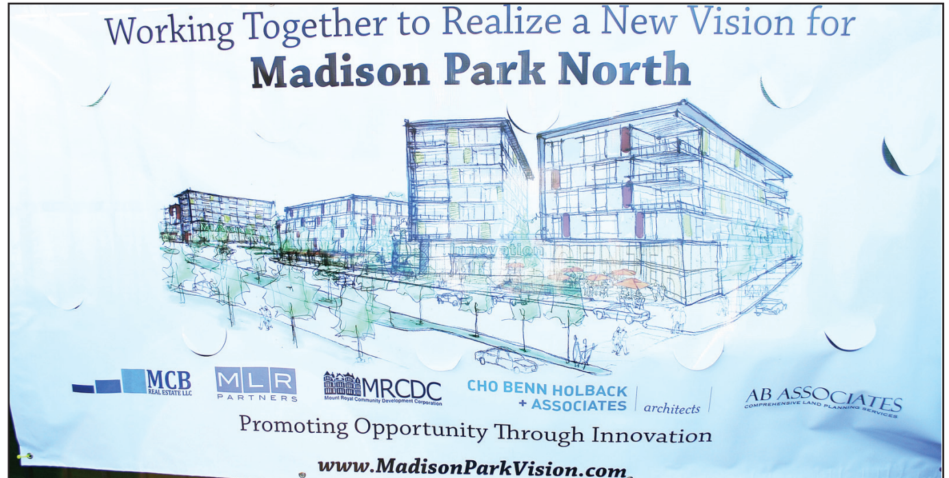
Banner with architects' rendering of Madison Park North redevelopment.

The project also reportedly includes the $31 million renovation underway for the John Eager Howard School where, across the street, a planned 50,000-square-foot in-