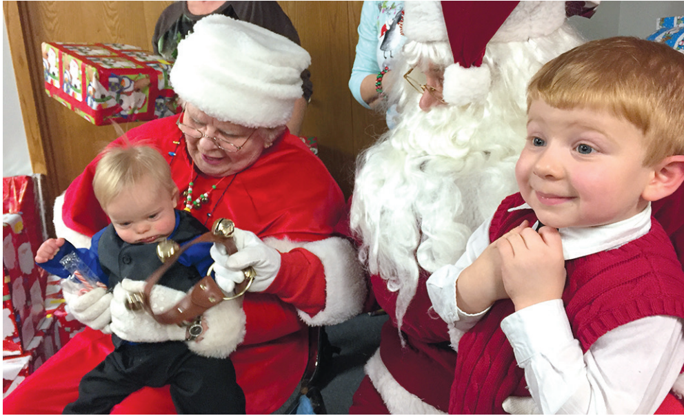
The Aitkin American Legion was jam-packed with families and children under 10 got gifts.