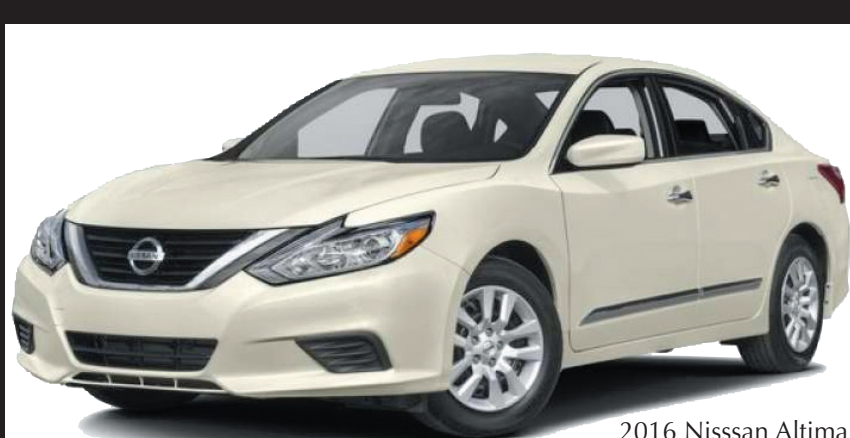
2016 Nissan Altima