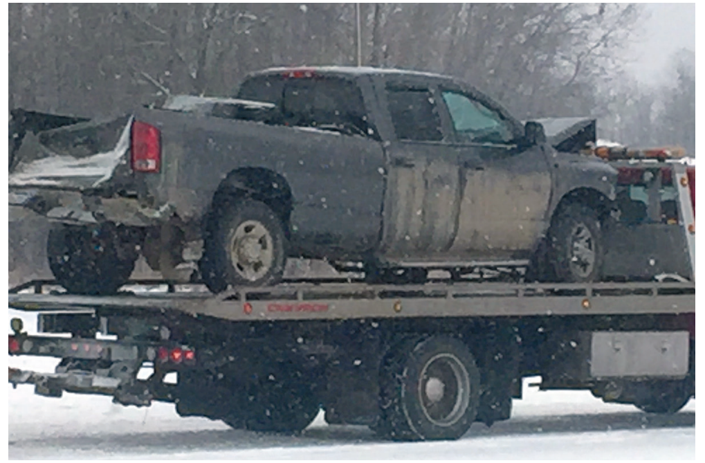
Shawn Philipp's 2003 Dodge pickup was also removed from the crash site. Philipp sustained no apparent injury.