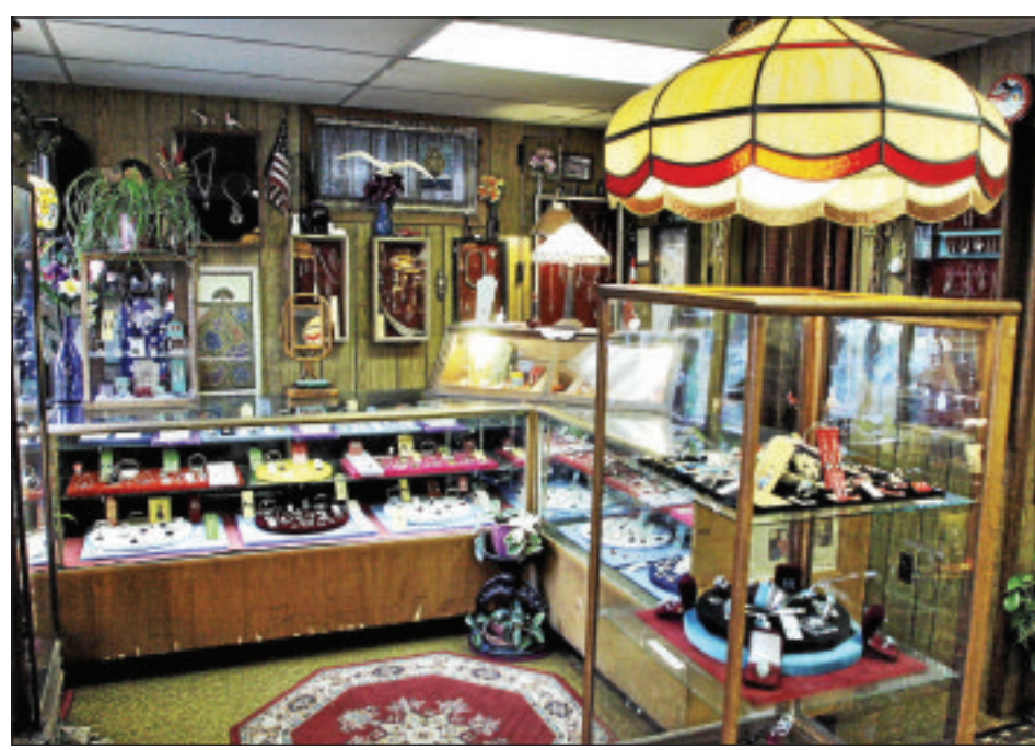
Silver Shoppe is located at 2452 E. High St. in Lower Pottsgrove.