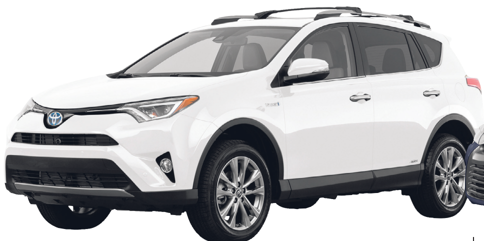
2017 Toyota Rav4 0.9% APR for 72 Months PLUS $500 Bonus Cash