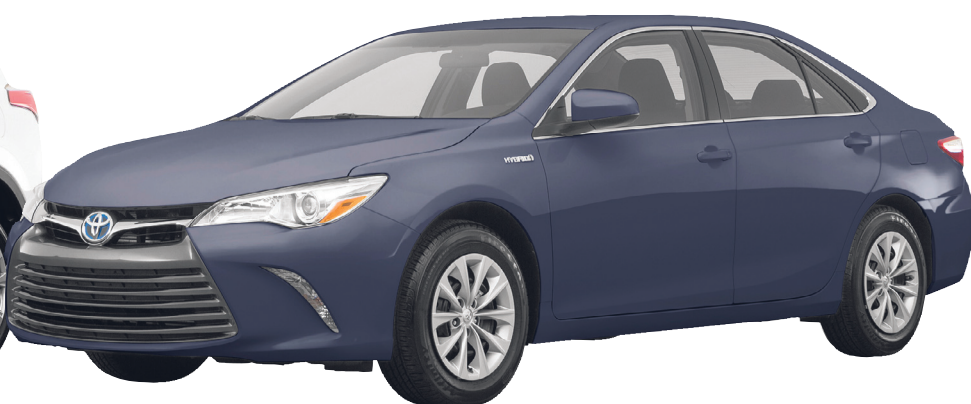
2017 Toyota Camry 0.0% APR for 72 Months PLUS $1500 Bonus Cash