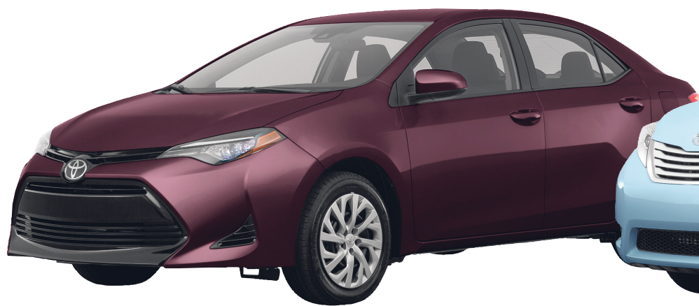
2017 Toyota Corolla 0.0% APR for 72 Months PLUS $1500 Bonus Cash