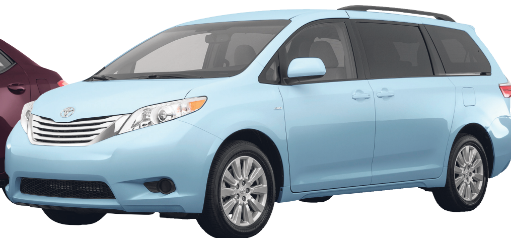
2016 Toyota Sienna 0.0% APR for 60 Months