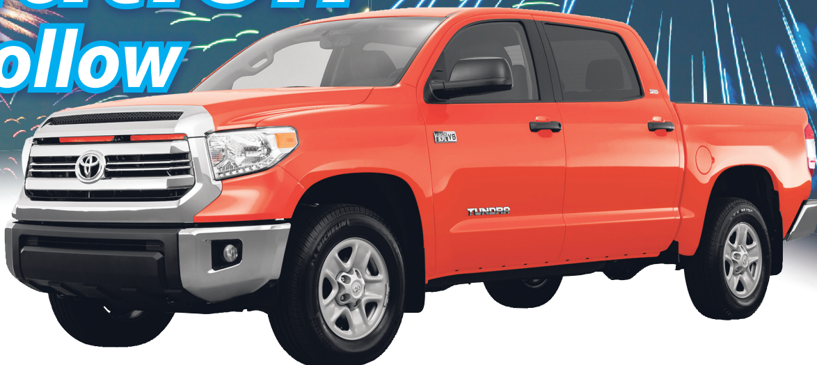
2017 Toyota Tundra 1.9% APR for 60 Months