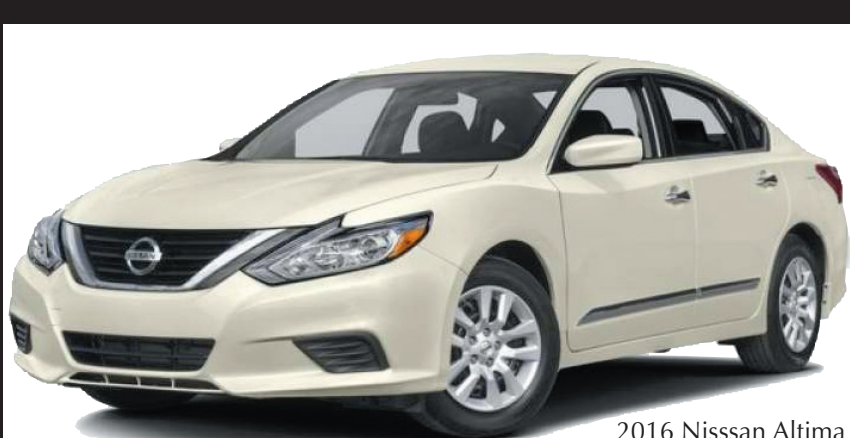
2016 Nissan Altima