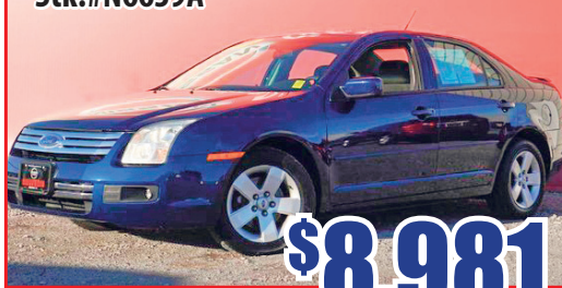
2007 Ford Fusion SE Stk.# N6639A