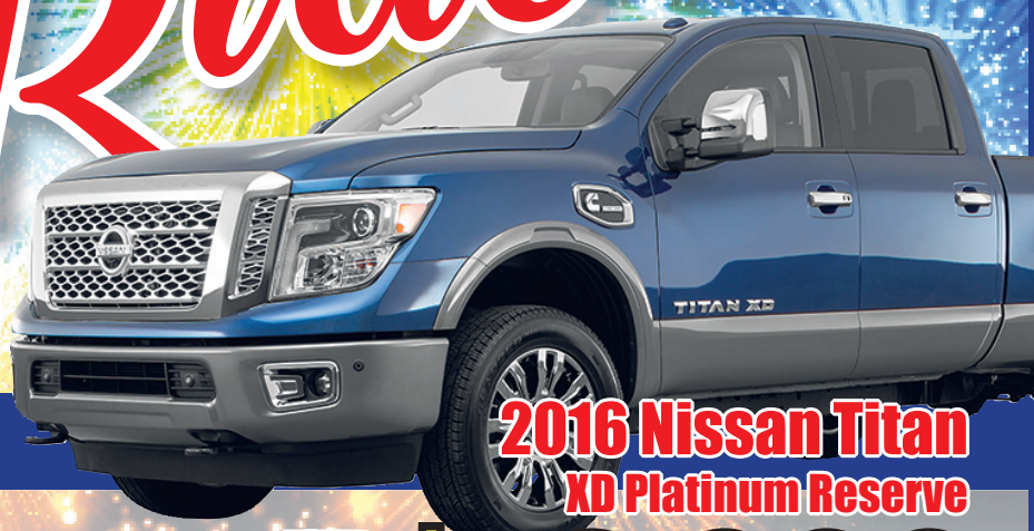
2016 Nissan Titan XD Platinum Reserve