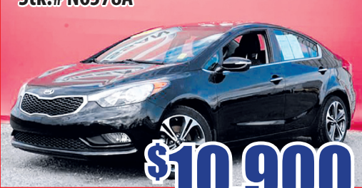
2014 Kia Forte EX Stk.# N6378A