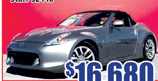
2010 Nissan 370Z Touring Stk.# S2446