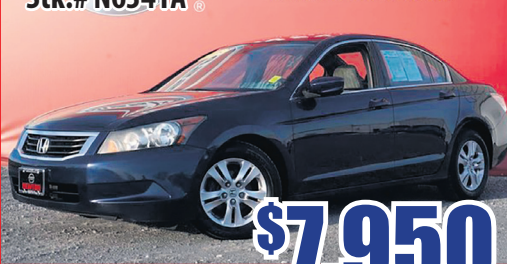
2008 Honda Accord LX-P Stk.# N6341A