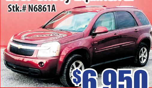
2007 Chevy Equinox LT Stk.# N6861A