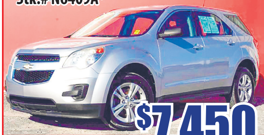
2010 Chevy Equinox LS Stk.# N6409A