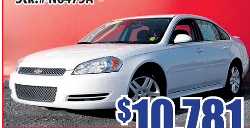
2013 Chevy Impala LT Stk.# N6475A