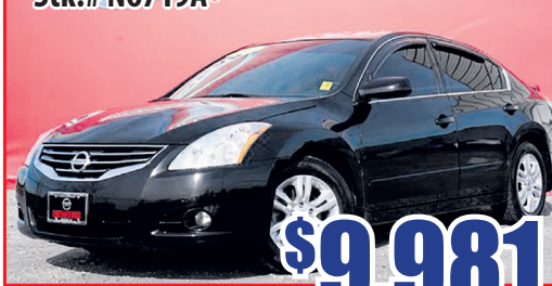
2012 Nissan Altima 2.5 S Stk.# N6719A