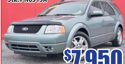
2006 Ford Freestyle Limited Stk.# N6313A