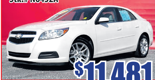
2013 Chevy Malibu ECO Stk.# N6432A