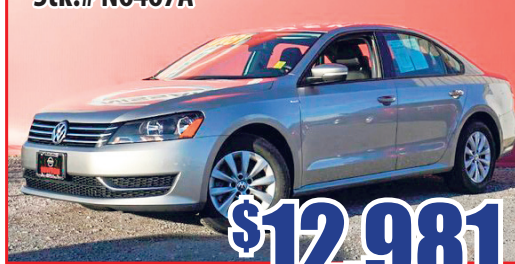
2014 Volkswagen Passat Stk.# N6467A