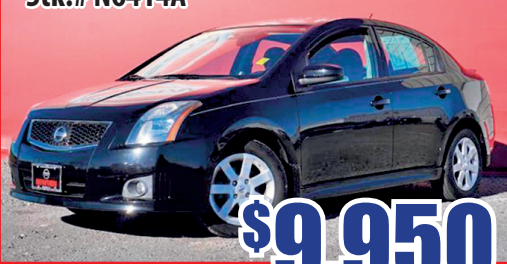
2010 Nissan Sentra 2.0 SR Stk.# N6414A