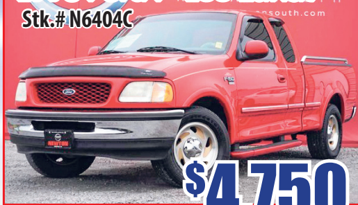
1998 Ford F-150 Lariat Stk.# N6404C