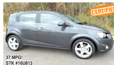
37 MPG! STK #16U813

2015 CHEVROLET SONIC LTZ • 2 Years Maintenance Included • XM Radio Subscription • 3 Years FREE OnStar • 12/12 Bumper to Bumper FREE Several to choose from $0 DOWN $149** PER MO.