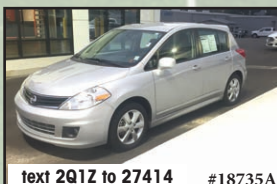
2011 KIA RIO Runs Great $5,865