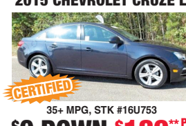
35+ MPG, STK #16U753