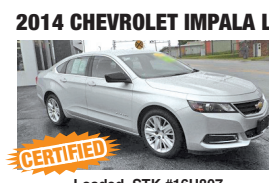
Loaded, STK #16U807

2015 CHEVROLET SONIC LTZ • 2 Years Maintenance Included • XM Radio Subscription • 3 Years FREE OnStar • 12/12 Bumper to Bumper FREE Several to choose from $0 DOWN $149** PER MO.