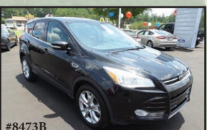
2013 FORD ESCAPE SEL SUV $17,888