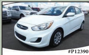
2015 HYUNDAI ACCENT GS HATCHBACK $11,888