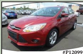
2014 Ford Focus SE Hatchback $13,888