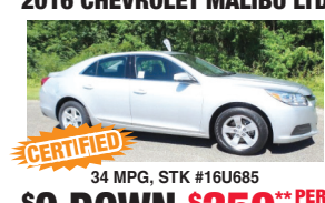
34 MPG, STK #16U685