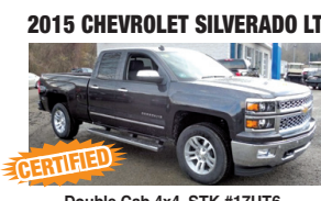
Double Cab 4x4, STK #17UT6