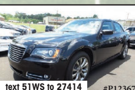
2014 CHRYSLER 300 S Very Nice $23,888