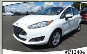
2015 FORD FIESTA SE HATCHBACK $12,888