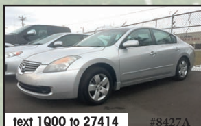
2008 NISSAN ALTIMA A STEAL AT..... $7,865