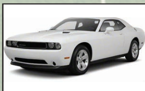
2012 DODGE CHALLENGER SXT, Coupe $15,865