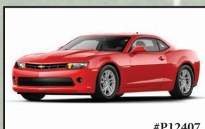
2014 CHEVY CAMARO SS W/2SS COUPE $29,888