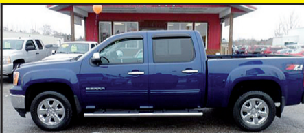
2012 SIERRA Stk. #7923 $27,995