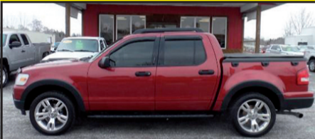
2007 FORD SPORT TRAC XLT Stk. #7916 $14,995