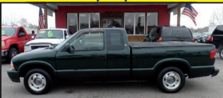
2001 GMC SONOMA SLS Stk. #7815A $4,995