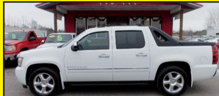
2009 CHEVROLET AVALANCHE LTZ Stk. #7871 $20,695