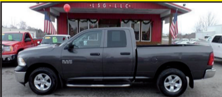
2014 DODGE RAM LOADED, Stk. #7895 $18,995