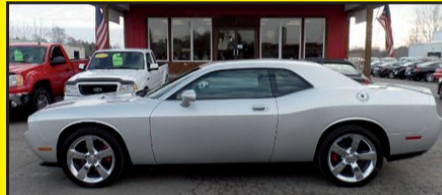
2010 DODGE CHALLENGER RT HEMI V8, Stk. #7751A $17,995