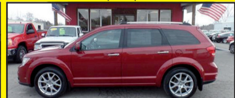
2011 DODGE JOURNEY RT AWD Stk. #7908 $13,995