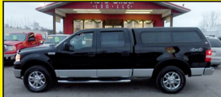
2006 FORD F150 XLT Stk. #7881 $15,995