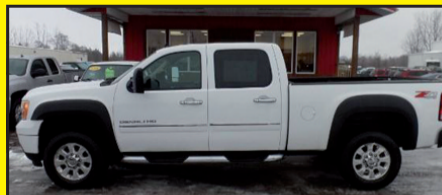
2012 GMC SIERRA 2500 HD DENALI Stk. #7894 $31,495