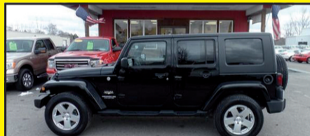
2010 WRANGLER SAHARA Stk. #7845 $22,995