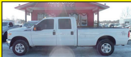
2015 FORD F250 SUPERDUTY LOADED, Stk. #7875 $29,495