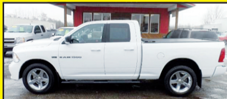
2011 RAM SPORT Stk. #7929 $22,995