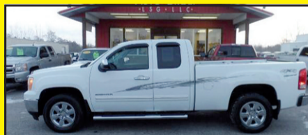
2011 GMC SIERRA SLT Low Miles, Stk. #7918 $25,995