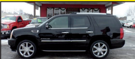
2007 CADILLAC ESCALADE Stk. #7877A $21,995