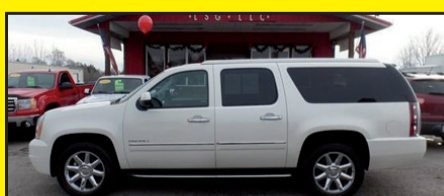
2013 GMC YUKON DENALI Stk. #7900 $36,995