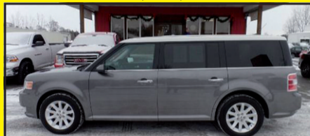
2009 FORD FLEX SEL Stk. #7839 $9,995