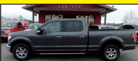
2015 FORD F150 SUPERCREW XLT Stk. #7906 $32,995