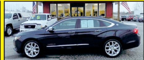
2014 IMPALA LTZ Stk. #7932 $21,995