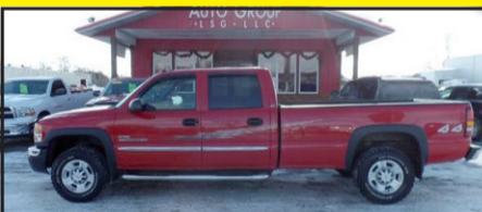
2005 SIERRA SLT Diesel, Stk. #7856 $23,495