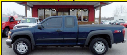
2004 CHEVROLET COLORADO Z71 Stk. #7880 $8,495