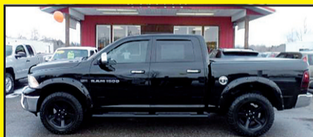
2012 RAM BIG HORN Stk. #7924 $24,995