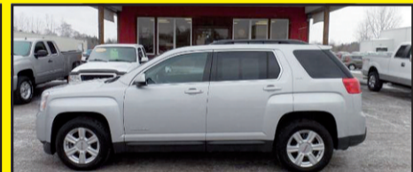
2015 GMC TERRAIN AWD Stk. #7919 $22,995