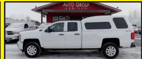
2015 CHEVROLET SILVERADO LT LOADED, Stk. #7869 $31,495