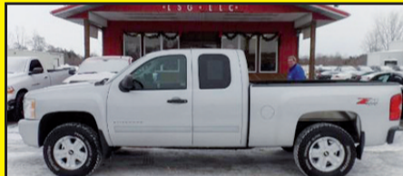
2010 CHEVROLET SILVERADO LT Stk. #7874 $19,495