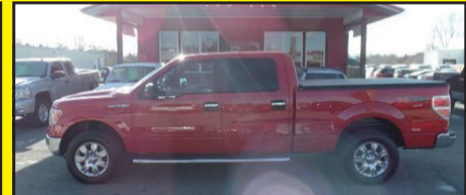
2010 FORD F150 CREW CAB XLT Stk. #7917 $18,995