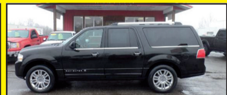
2012 GMC NAVIGATOR LOADED, Stk. #7907 $27,495