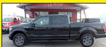
2015 FORD F150 LARIAT 4X4 Stk. #7911 $41,995