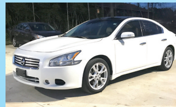
2013 Nissan Maxima GLE $20,999 or $310/mo