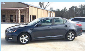
2015 Kia Optima $13,990 or $199/mo