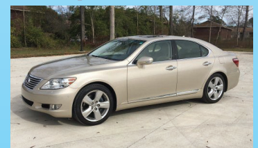
2012 Lexus LS 460 $33,990 or $499/mo