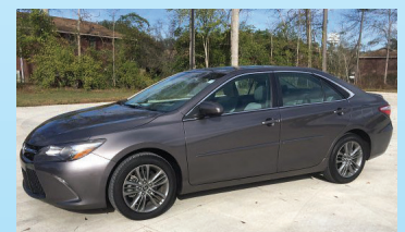
2015 Toyota Camry SE $15,990 or $239/mo