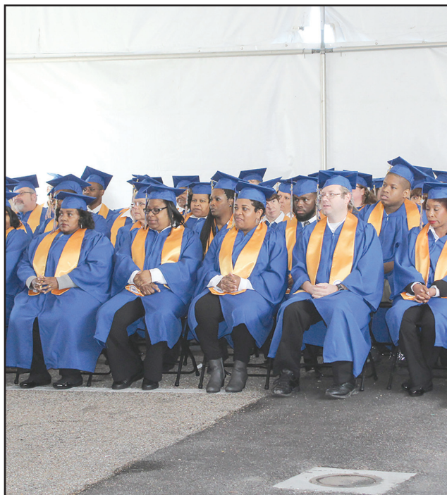
The first graduating class of the new Walmart Academy consisted of 60 store level managers.

Walmart representatives said Walmart plans to build approximately 200 academies in the U.S. by the end of 2017. The Laurel facility is the 55th Walmart Academy.