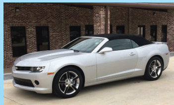
2015 Chevy Camaro 1LT $20,890 or $308/mo