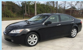
2008 Lexus ES 350 $14,990 or $219/mo