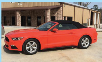
2015 Ford Mustang V6 $17,495 or $257/mo