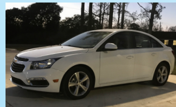
2015 Chevy Cruze 2LT $14,990 or $169/mo