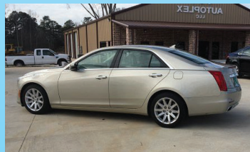
2014 Cadillac CTS Lux $29,890 or $449/mo