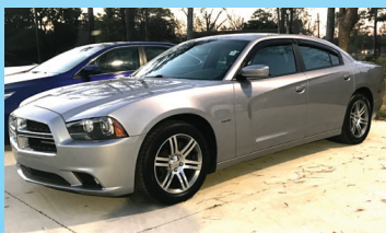
2014 Dodge Charger RT Hemi $24,990 or $374/mo