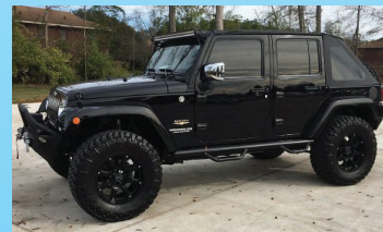
2012 Jeep Wrangler $33,880 or $499/mo