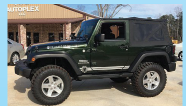
2010 Jeep Wrangler S $21,990 or $329/mo