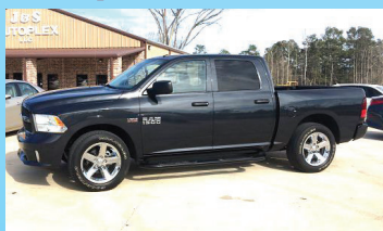
2014 Ram 1500 SLT Hemi $25,990 or $389/mo