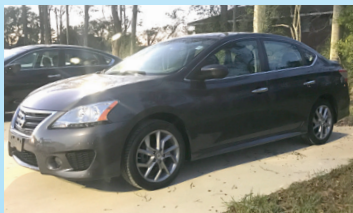
2013 Nissan Sentra SV $11,890 or $159/mo