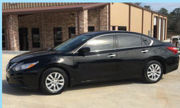
2016 Nissan Altima $16,990 or $249/mo