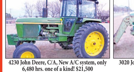
4230 John Deere, C/A, New A/C system, only 6,480 hrs. one of a kind! $21,500

JUST ARRIVED 155 puma Case, C/A, 4x4 MXM 190 pro Case, C/A, 4x4 MXM 120 Case, C/A, 4x4 MX 150 Case, C/A, 4x4 TM190 New Holland, C/A, 4x4 8360 New Holland, C/A, 4x4 MX285 Case, C/A, 4x4 4255 John Deere, C/A, 4x4