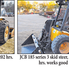
JCB 185 series 3 skid steer, wide rubber, 3,370 hrs. works good $10,500