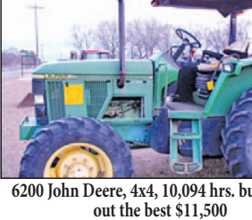
6200 John Deere, 4x4, 10,094 hrs. but checks out the best $11,500