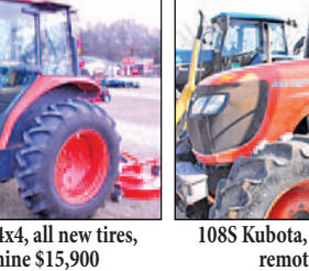
108S Kubota, C/A, 4x4, LH reverser, triple remotes, 4,100 hrs. $23,500