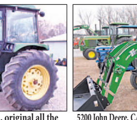
5200 John Deere, CAB (heat no a/c) 2952 hrs. new rear tires & new Woods LU126 QA ldr. with 6' bucket $14,850