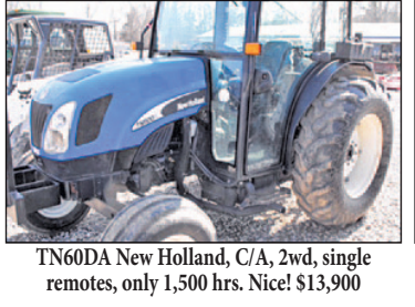
TN60DA New Holland, C/A, 2wd, single remotes, only 1,500 hrs. Nice! $13,900