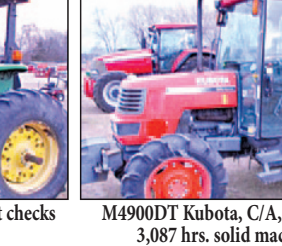
M4900DT Kubota, C/A, 4x4, all new tires, 3,087 hrs. solid machine $15,900