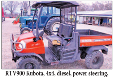
RTV900 Kubota, 4x4, diesel, power steering, $5,850