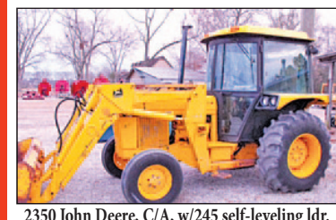
2350 John Deere, C/A, w/245 self-leveling ldr. (original yellow) $12,900