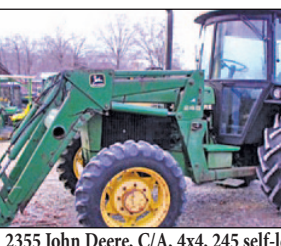
2355 John Deere, C/A, 4x4, 245 self-leveling ldr. checks out good $19,900