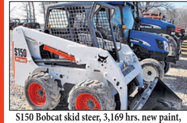
S150 Bobcat skid steer, 3,169 hrs. new paint, operates great $11,900