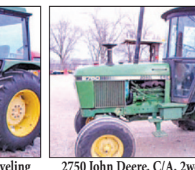
2750 John Deere, C/A, 2wd, original all the way! $14,900