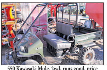
550 Kawasaki Mule, 2wd, runs good, price reduced! $1,950