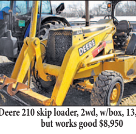
Deere 210 skip loader, 2wd, w/box, 13,202 hrs. but works good $8,950