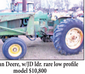
3020 John Deere, w/JD ldr. rare low profile model $10,800