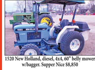
1520 New Holland, diesel, 4x4, 60" belly mower w/bagger. Supper Nice $8,850