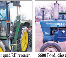
6600 Ford, diesel, p/s, c/a (not working) dual power and remotes $8,800