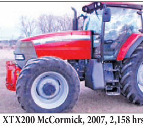
XTX200 McCormick, 2007, 2,158 hrs. 32/24 speed, Super Sharp $68,500