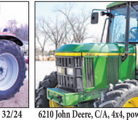
6210 John Deere, C/A, 4x4, power quad RH reverser, dual remotes, 3,500 hrs. Super Clean! $29,500