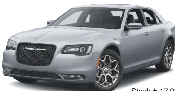
Stock # 17-0279

All-Wheel Drive, Leather Trimmed Bucket Seats, 3.6L V-6, 8.4 Screen, AWD and Much More!!!