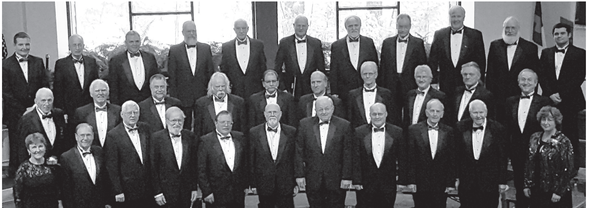
The Grand Rapids Area Male Chorus performs at The Edge Center in Bigfork on February 26th 20th at 2:30 PM. Prices $10 adults, $5 children.

The Grand Rapids Area Male Chorus (GRAMC) is performing a concert at the Edge Centre in Bigfork on Sunday, February 26 at 2:30 p.m. Tickets are $10 for adults and $5 for children.