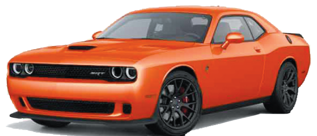
Stock # 16-0502

6.2L Super Hemi V-8 SRT Hell Cat Engine, 6-Speed Manual Trans, Premium Leather Seats and MORE !!!!