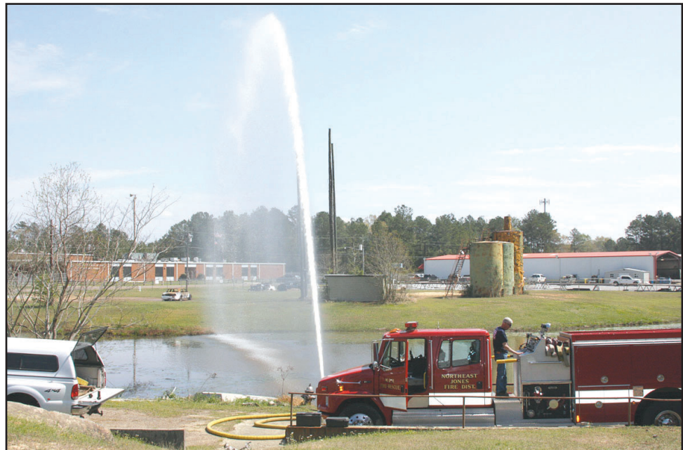
2014 pump testing of Jones County Volunteer Fire Service fire apparatus.

“Some departments are getting close to operating in the red,” said Pitts, “but we are all doing our due diligence to run the departments as efficiently as possible. I don’t