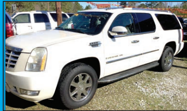
2007 CADILLAC ESCALADE ESV LOADED!!!!