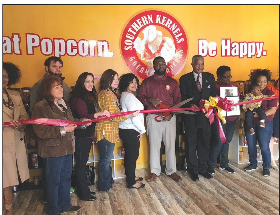
Southern Kernel Gourmet Popcorn in downtown Laurel recently held their ribbon-cutting, which was hosted by the Jones County Chamber of Commerce. Southern Kernel is located at 541 Central Avenue in Laurel.