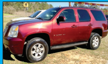
2007 GMC YUKON SLT LEATHER, SUNROOF, 3RD ROW SEAT