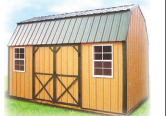
AS SHOWN 10X12 $123.84 MONTH Rent to Own