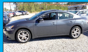
2013 NISSAN MAXIMA - LOADED!!! LEATHER, HEATED SEATS, BU CAM, SUNROOF

• LUXURY • SPORTS • SUV'S • TRUCKS DEAL ON THE HILL