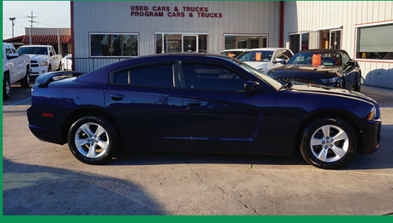
13 Dodge Charger SE Sedan