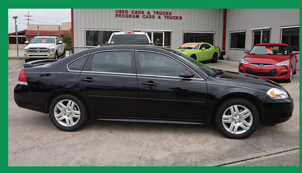
16 Chevrolet Impala Limited Sedan $16,997 #10365.....