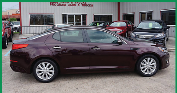
14 Kia Optima Sedan