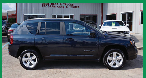
16 Jeep Compass Sport SUV