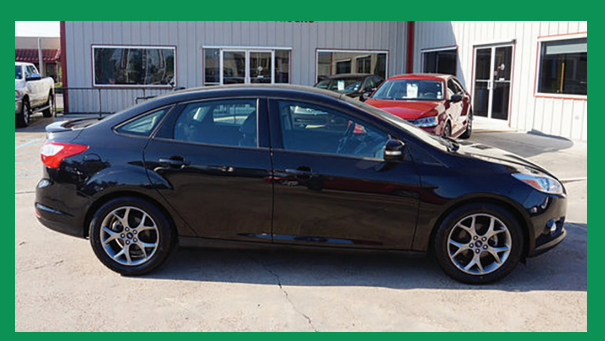
13 Ford Focus SE Sedan