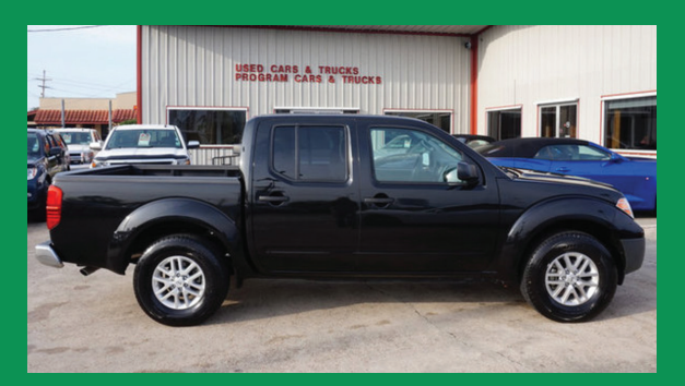
16 Nissan Frontier Crew Cab $22,497