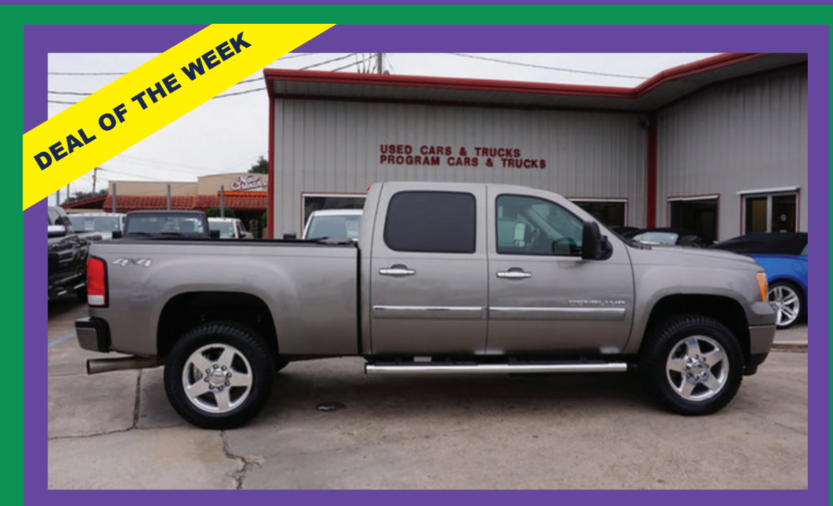
13 GMC Sierra 2500HD Denali