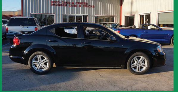
14 Dodge Avenger SE Sedan