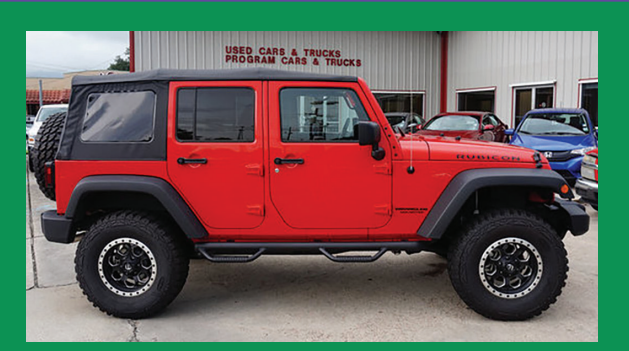
15 Jeep Wrangler Unlimited Rubicon 4x4 $39,997