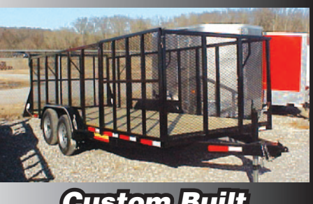
Custom Built Trailers