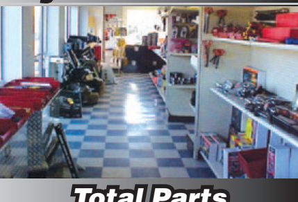
Total Parts & Accessories