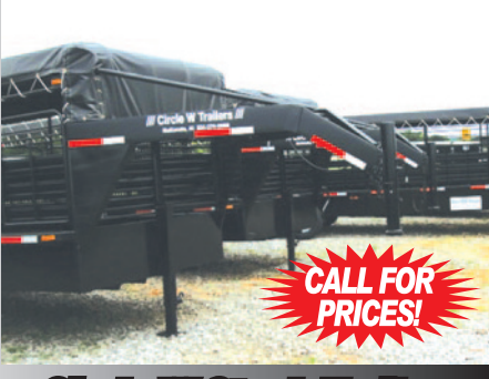
Circle W Stock Trailers Many Sizes To Choose From