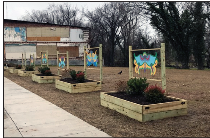
The revitalized Pimlico Triangle Garden awaiting art made by students of the US Dream Academy.