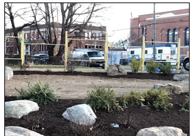
The revitalized Pimlico Triangle Garden awaiting art made by students of the US Dream Academy.

one side, we've put in a stone patio area where we will have some benches to sit and there will be some art work."