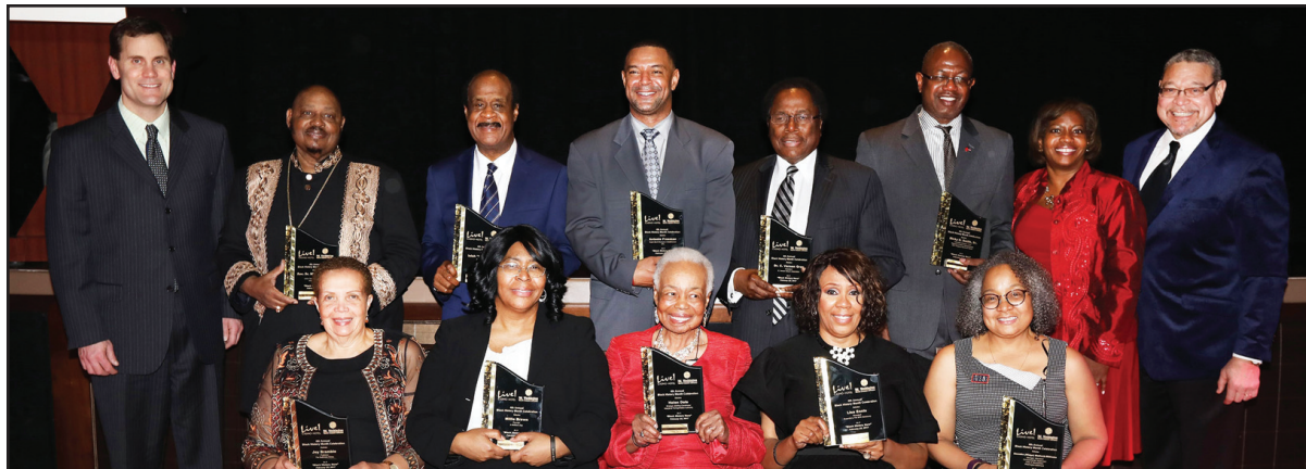
The 4th Annual Black History Heroes Awards Honorees. The group was honored on Thursday, February 23, 2017 at Live! Casino & Hotel located at 7002 Arundel Mills Circle in Hanover, MD for their contributions to the community.