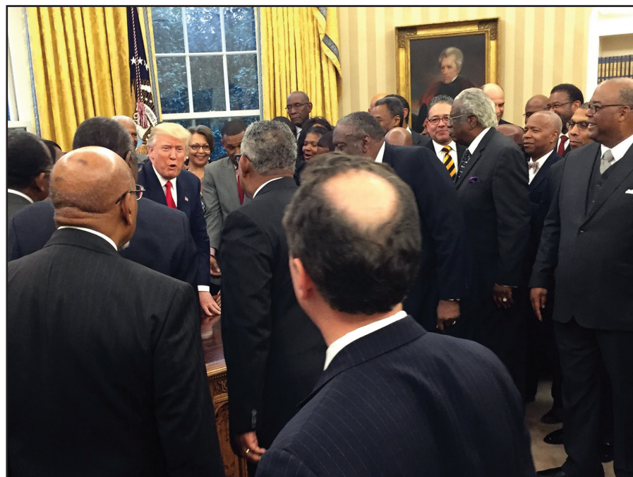
President Donald Trump met with the presidents and chancellors from the nation’s Historically Black Colleges and Universities in the Oval Office at the White House on February 27, 2017.