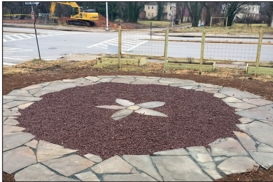
A new gathering space at 4701 Park Heights Avenue for children waiting at bus stop after school.