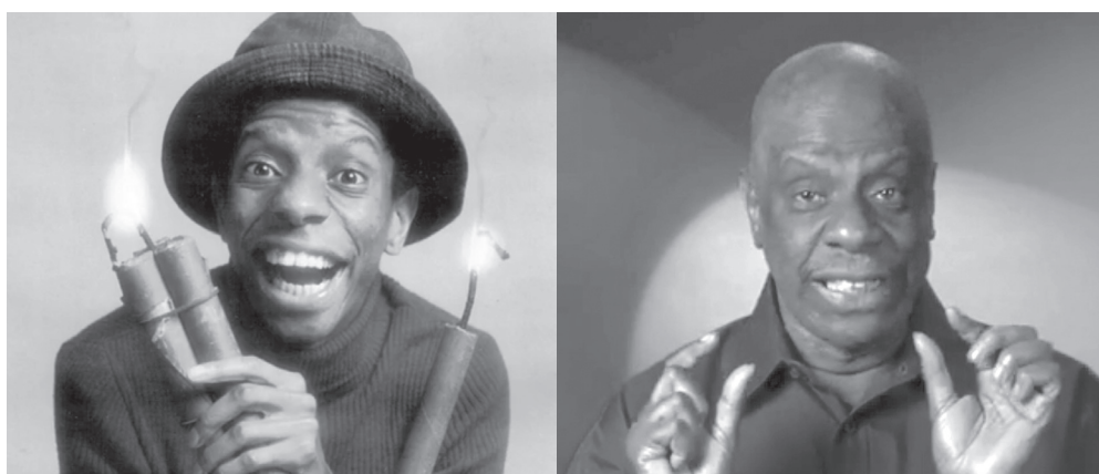
(Left) Jimmie Walker became known when at 26-years-old he played the strutting wide grinning teenage son on the television sitcom, Good Times . (Right) Today, Walker is in the stand-up circuit, touring an average of 25-30 weeks a year. He will be appearing at the 40 Club Banquet Center in Aitkin on Friday, March 17. Advance tickets may be obtained by calling 218-927-2903.

Their headquarters is located at 36559 US Highway 169, one mile east of Aitkin, MN. MLEC and Consolidated Telecommunications Company (CTC) from Brainerd were the recipient of a 2076 Border-to-Border Broadband grant to extend fiber-to-the-home to approximately 850 members.