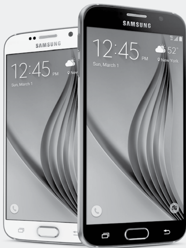
SAMSUNG Galaxy S6

Get a $150 U.S. Cellular® Promotional Card for every new line of service you activate with a new Smartphone. Plus, we'll pay off your old contract up to $350 per line.