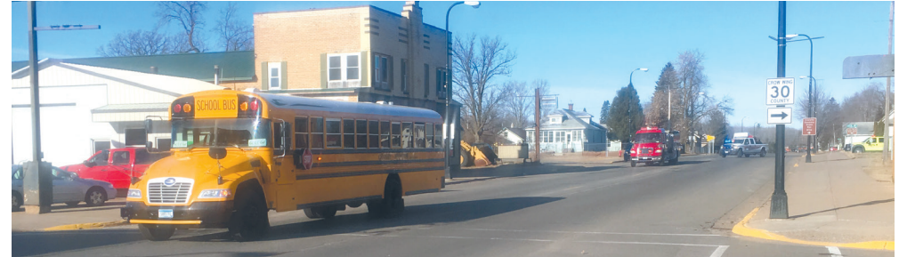
With local fire department fire trucks sirens screaming, the Crosby-Ironton Rangers boys' basketball team are given a rousing send-off as they depart Wednesday, March 22 at 9:30 a.m. for the Class AA state tournament.

The Eskomos trailed for most of the game, but they cut the Rangers' lead down to 4 at one point. With a minute left to go in regulation the lead was at six.