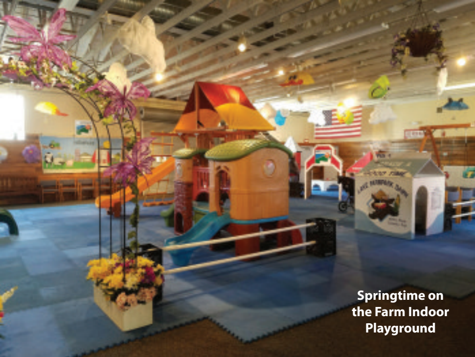
Springtime on the Farm Indoor Playground