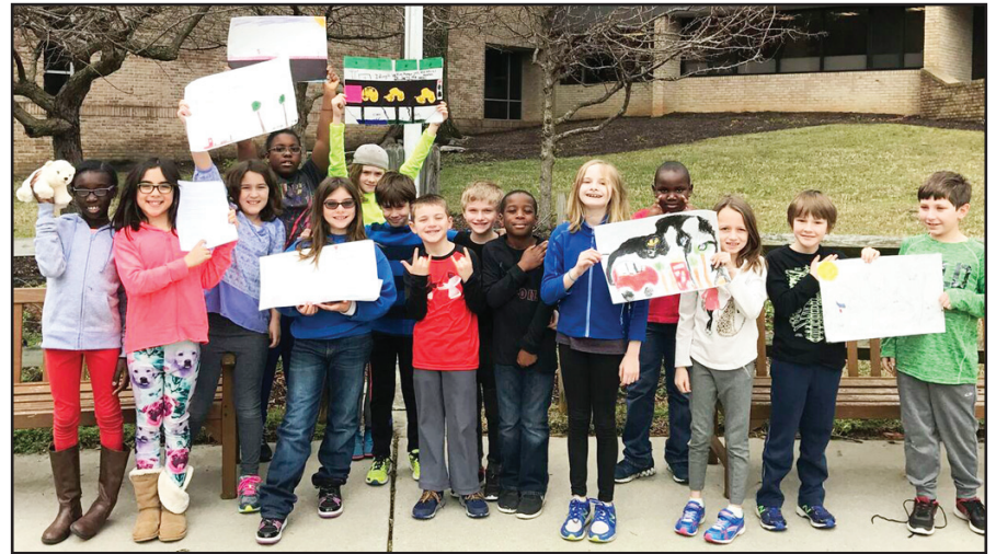
Third grade class in front of Park School getting ready to hang their posters