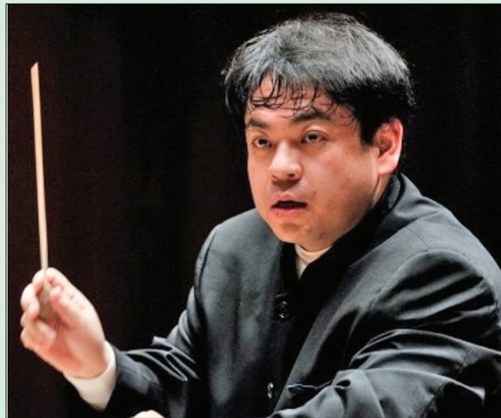
Conductor Tatsuya Shimono

For tickets call 408.286.2600 or visit: www.symphonysiliconvalley.org The California Theater is located at 345 So. First Street in downtown San Jose