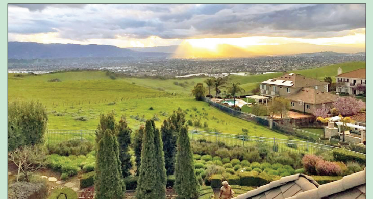
A proposal to build hillside homes near Silver Creek Valley Country Club will require moving the Greenbelt line if approved.

SEE OUR LISTINGS OF LOCAL PLACES OF WORSHIP AND CLASSIFIED ADVERTISEMENTS INSIDE THIS ISSUE