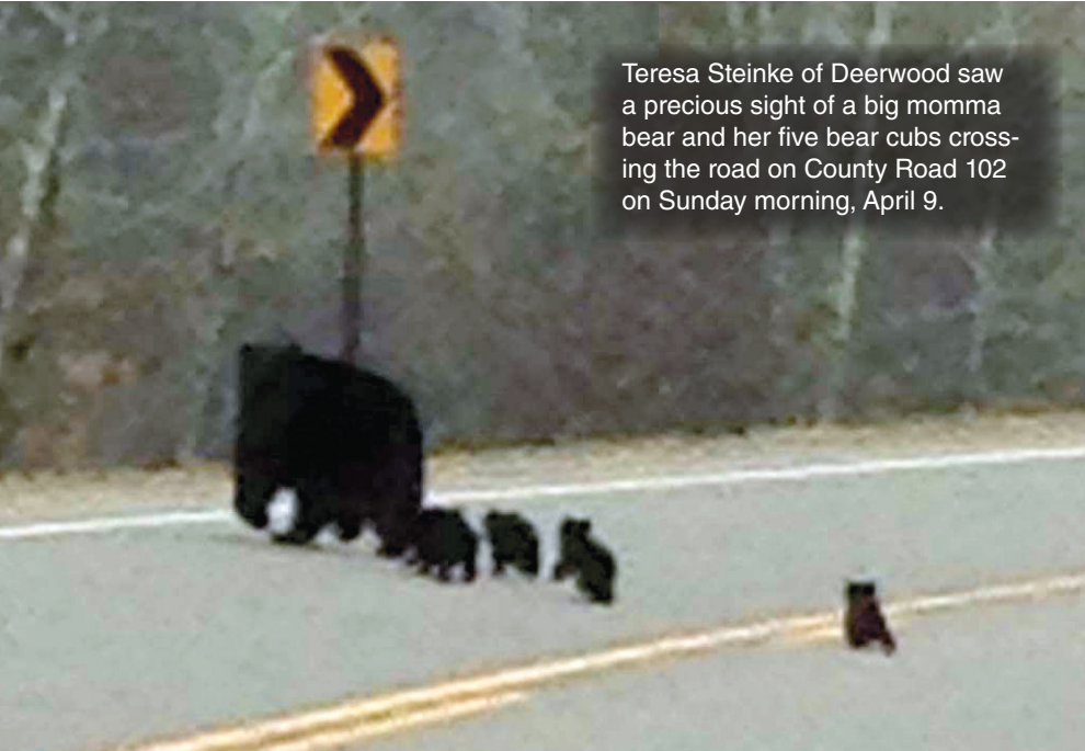
Teresa Steinke of Deerwood saw a precious sight of a big momma bear and her five bear cubs crossing the road on County Road 102 on Sunday morning, April 9.