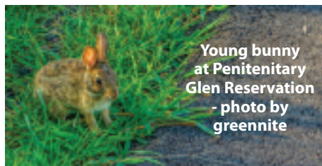
Young bunny at Penitentiary Glen Reservation

The Nature Center and Wildlife Center are open 9 am to 5 pm. The Nature Store, open until 4:30 pm, is a great resource for "fun" nature-related toys, field guides for adults and children, nature-inspired t-shirts, binoculars by VORTEX, bird feeders and wildlife houses. Snacks and beverages are also available for purchase.