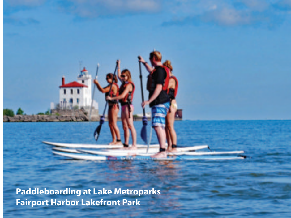
Paddleboarding at Lake Metroparks Fairport Harbor Lakefront Park

Penitentiary Glen Reservation is located at 8668 Kirtland-Chardon Rd in Kirtland. For more information, visit www.lakemetroparks.com or call 440-256-1404.