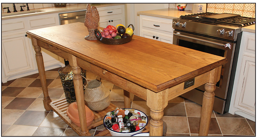
Ben's beautifully crafted white oak Baker's Table.