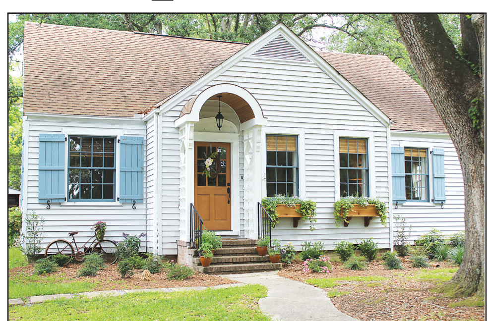
The Carson House located on Euclid Avenue.