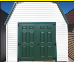
10x14 High Barn 8 Ft. Loft $2,720