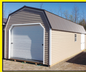
12x32 Roll up door 2 windows, 10 ft. Loft, 6 Ft. Double Doors $5,434