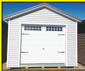
12x24 8x7 Carriage House Style, 3 Windows, Entry Door, 12' work bench $5,120