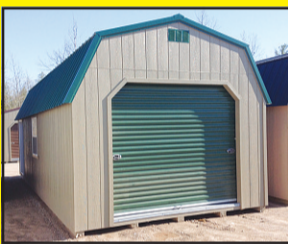
12x28 7x7 Roll up door, 1 entry door, 2 windows, 8 ft. loft $4,890

SEE YOU @ YODER'S QUILT AUCTION MAY 19 & 20!