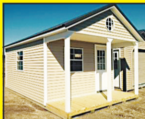
12x20 Cabin 5 windows $4,940

Statewide Delivery - Free Delivery w/ in 70 miles!