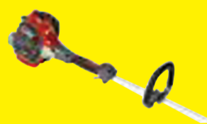
DS 2400 S TRIMMER 10% OFF REGULAR RETAIL PRICES