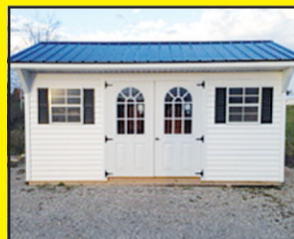
10x16 11 Lite Doors, 2 Windows $3,170