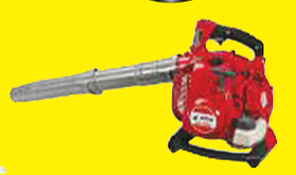
SA 3000 BLOWER

HERSHBERGER'S PRO HARDWARE 10289 N. Leaton Rd., Clare, MI 48617-9107 (989) 386-5338 Full Line of Hardware & Building Supplies Stove & Furnaces All Fuel Chimneys