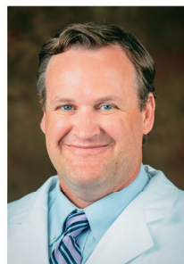
Member of the Medical Staff of Tennova Healthcare

To help you get back to your active life, we provide services ranging from general orthopedic care and sports medicine to minimally invasive hip, knee and shoulder replacements.