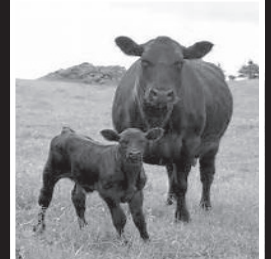
our local beef farmers! BEEF FACT: 11 leather basketballs can be made from 1 cowhide.

apartments Milton, IA. Kitchen appliances & heat furnished. Very reasonable rent. PH: 641-757-0201 09 FOR SALE: Cornish cross