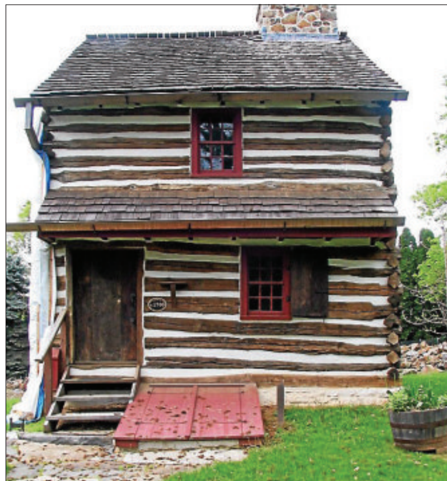
The Southery Log House.