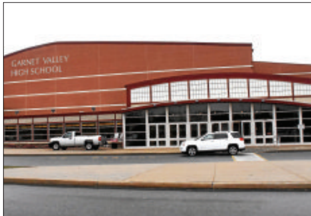
Garnet Valley High School.

599 Smithbridge Road, Glen Mills 610-579-4150 SCHOOL » PAGE 6