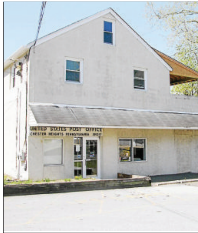
This post office is at 1 Smithbridge Road, Chester Heights. BETTY LOU ROSELLE - DCNN

Phone: 610-459-9548 Hours: Weekdays 8 a.m. - noon and 1 - 4:30 p.m.; Saturday 9 a.m. - noon; closed Sunday