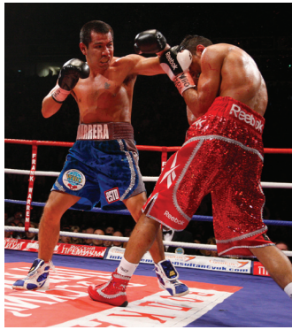
Mexico's Marco Antonio Barrera, left, and Britain's Amir Khan fight during a 2009 WBA International Lightweight Championship boxing fight in Manchester, England. Barrera will be inducted into the International Boxing Hall of Fame on Sunday.

Born January 17, 1974 in Mexico City, Mexico. A five-time Mexican national champion, Barrera posted a 56-4 amateur record before turning pro in 1989 at age 15 and won his first 43 bouts.