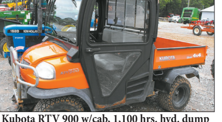
Kubota RTV 900 w/cab, 1,100 hrs. hyd. dump $6,850