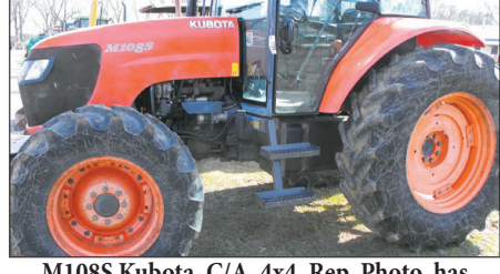
M108S Kubota, C/A, 4x4, Rep. Photo. has Kubota loader $28,500