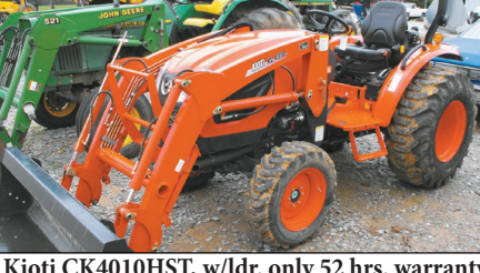
Kiotti CK4010HST, w/ldr. only 52 hrs. warranty remaining, like new $18,500