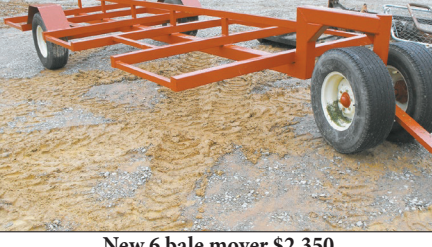
New 6 bale mover $2,350