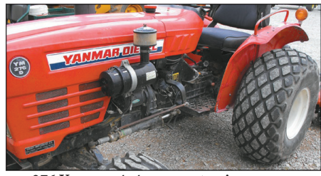
276 Yanmar, 4x4, power steering, power shuttle, 1,618 hrs. CLEAN $4,850