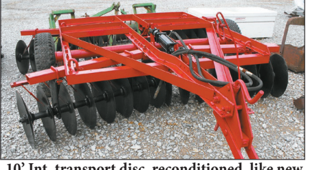
10' Int. transport disc. reconditioned, like new blades, full scrapes, w/cyl. $2,850