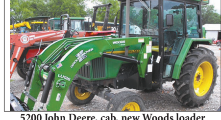
5200 John Deere, cab, new Woods loader $14,800