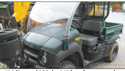
600 Kawasaki Mule, 269 hrs. front spreader, very, very NICE! $3,200