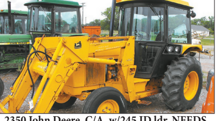
2350 John Deere, C/A, w/245 JD ldr. NEEDS CLUTCH! $10,500