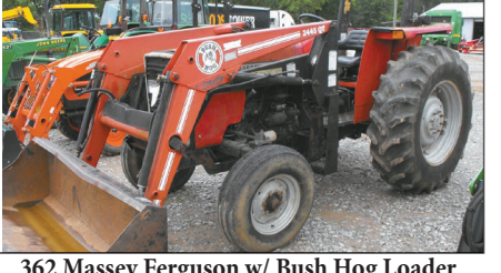
362 Massey Ferguson w/ Bush Hog Loader 1,800 hrs. $9,850