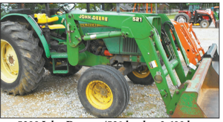
5300 John Deere w/521 loader, 3,600 hrs. $11,900