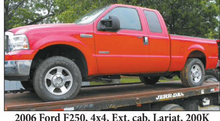
2006 Ford F250, 4x4, Ext. cab, Lariat, 200K miles, AS-IS bad engine! $2,800