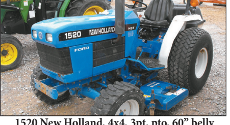
1520 New Holland, 4x4, 3pt, pto, 60" belly mower w/bagger, Super nice $7,850