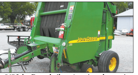
567 John Deere trailer w/monitor clean unit $9,500