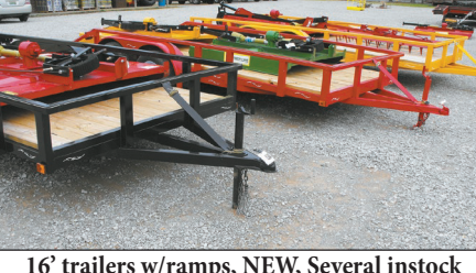
16' trailers w/ramps, NEW, Several instock $1,350