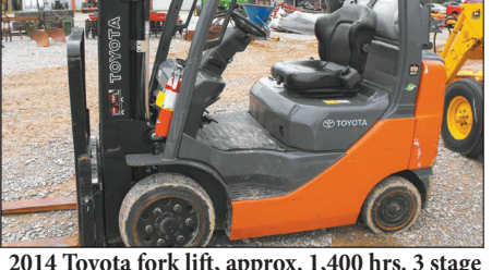
2014 Toyota fork lift, approx. 1,400 hrs. 3 stage mast, side shift, very nice $11,900