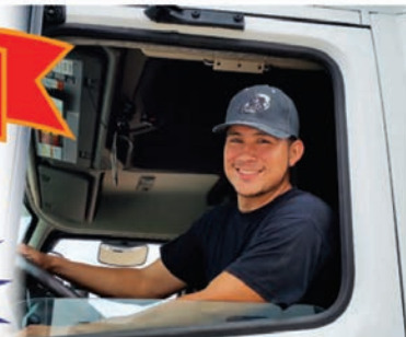
2016 - 2017 Automatic Volvo